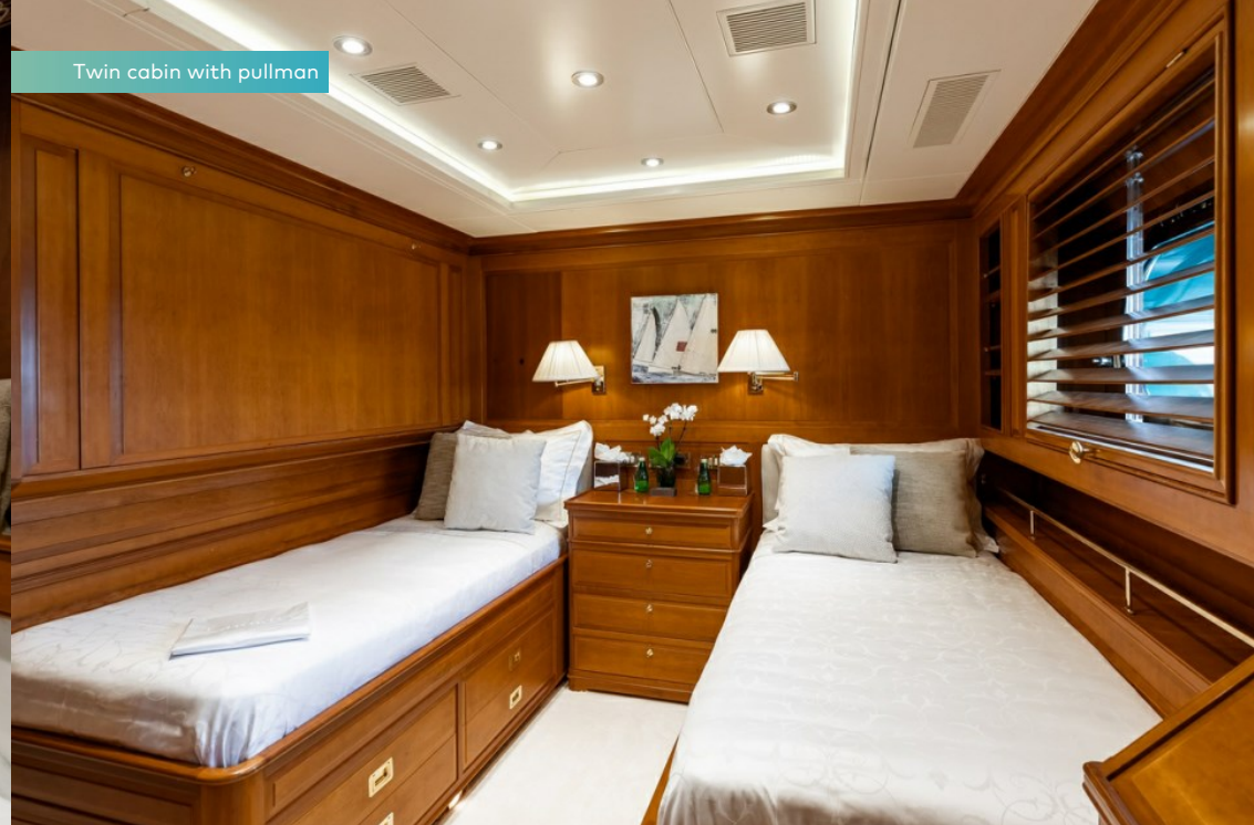
Twin cabin shower room en suite