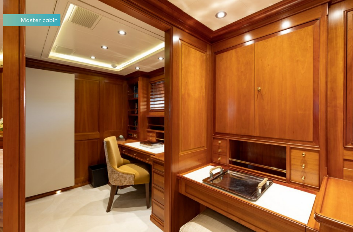
Master cabin bathroom en suite