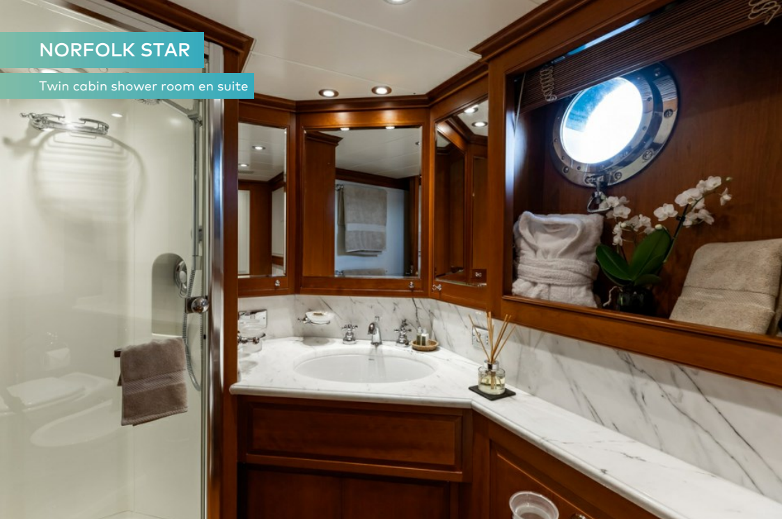
Twin cabin shower room en suite