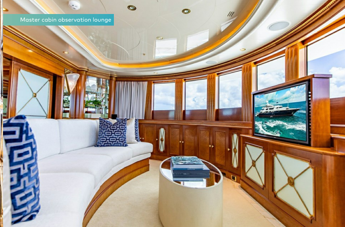
Master cabin observation lounge