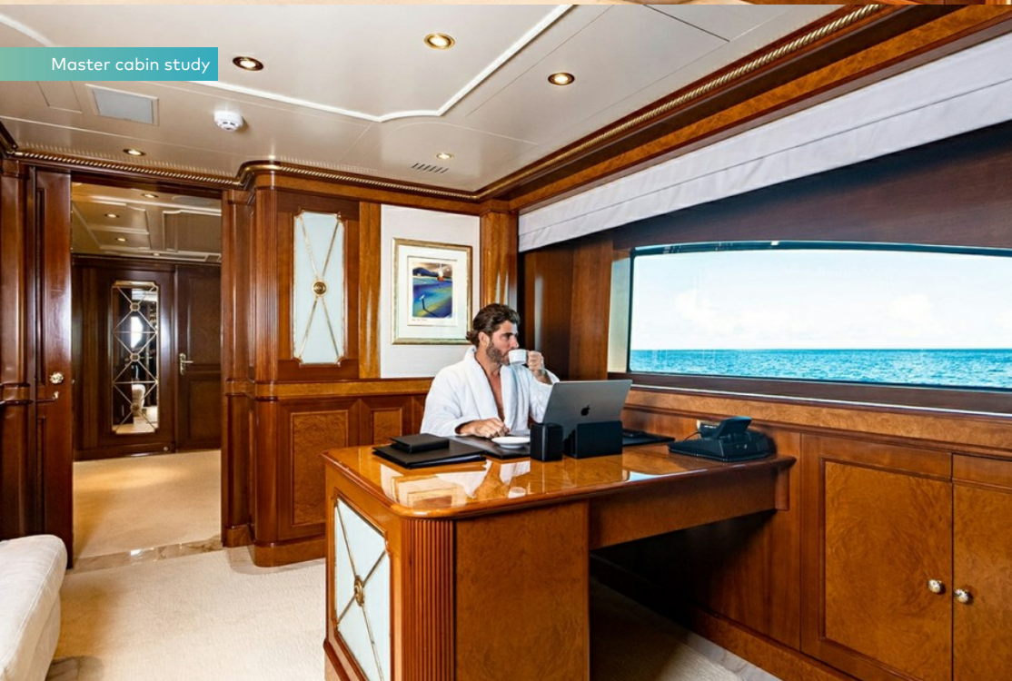
Master cabin study