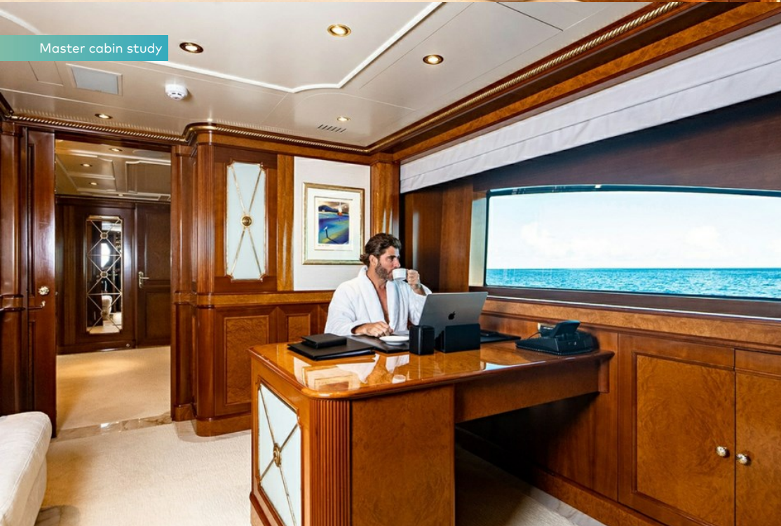
Master cabin study