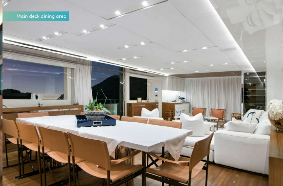
Main deck dining area