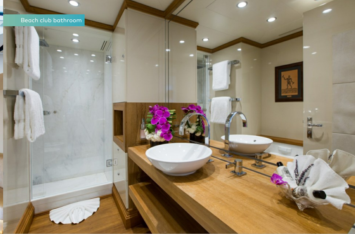
Beach club bathroom