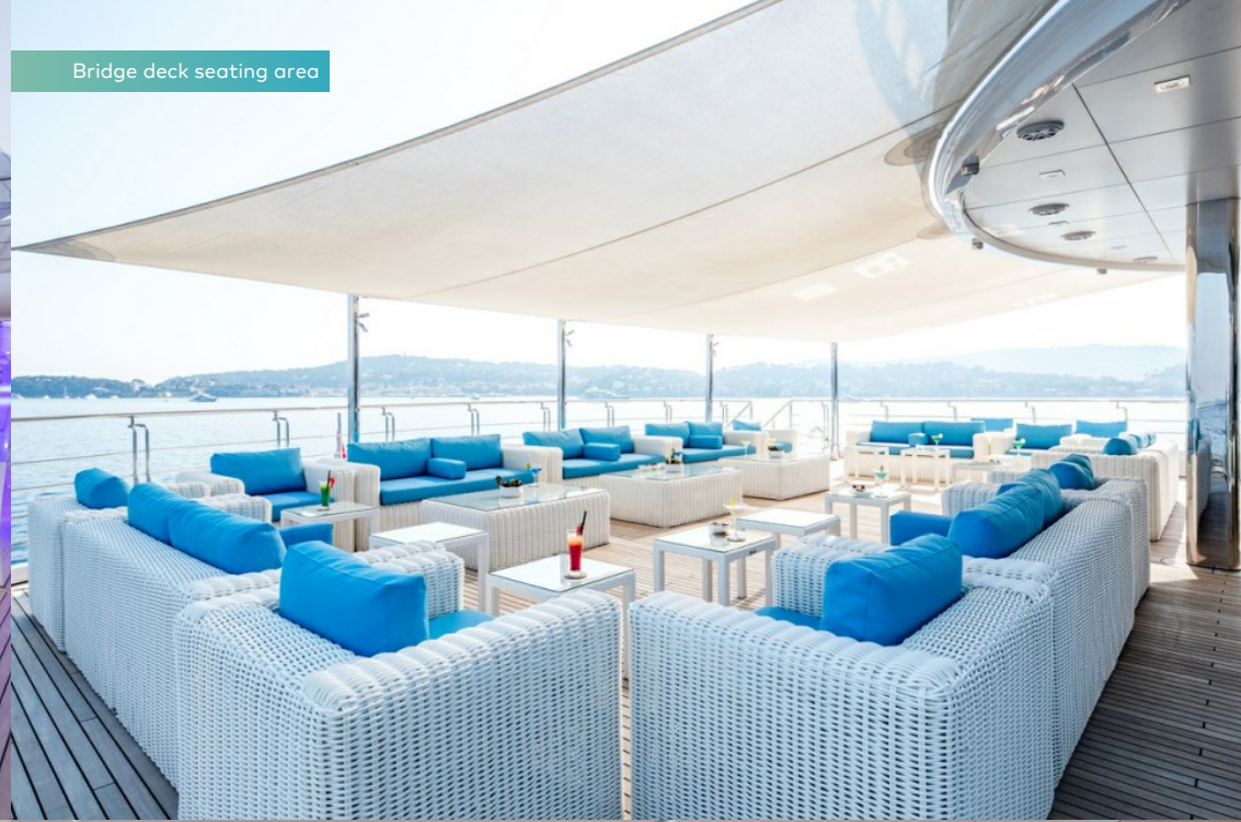
Bridge deck seating area