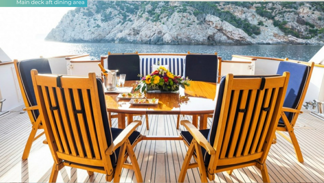
Main deck aft dining area