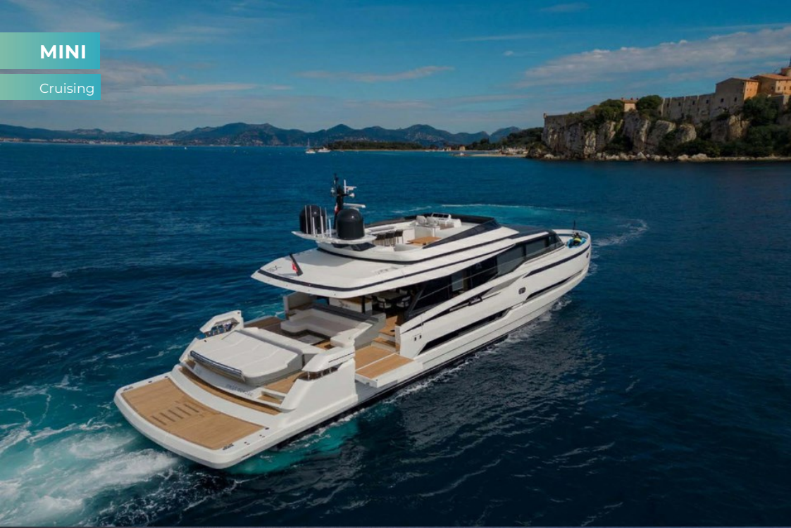
Sun deck aerial view