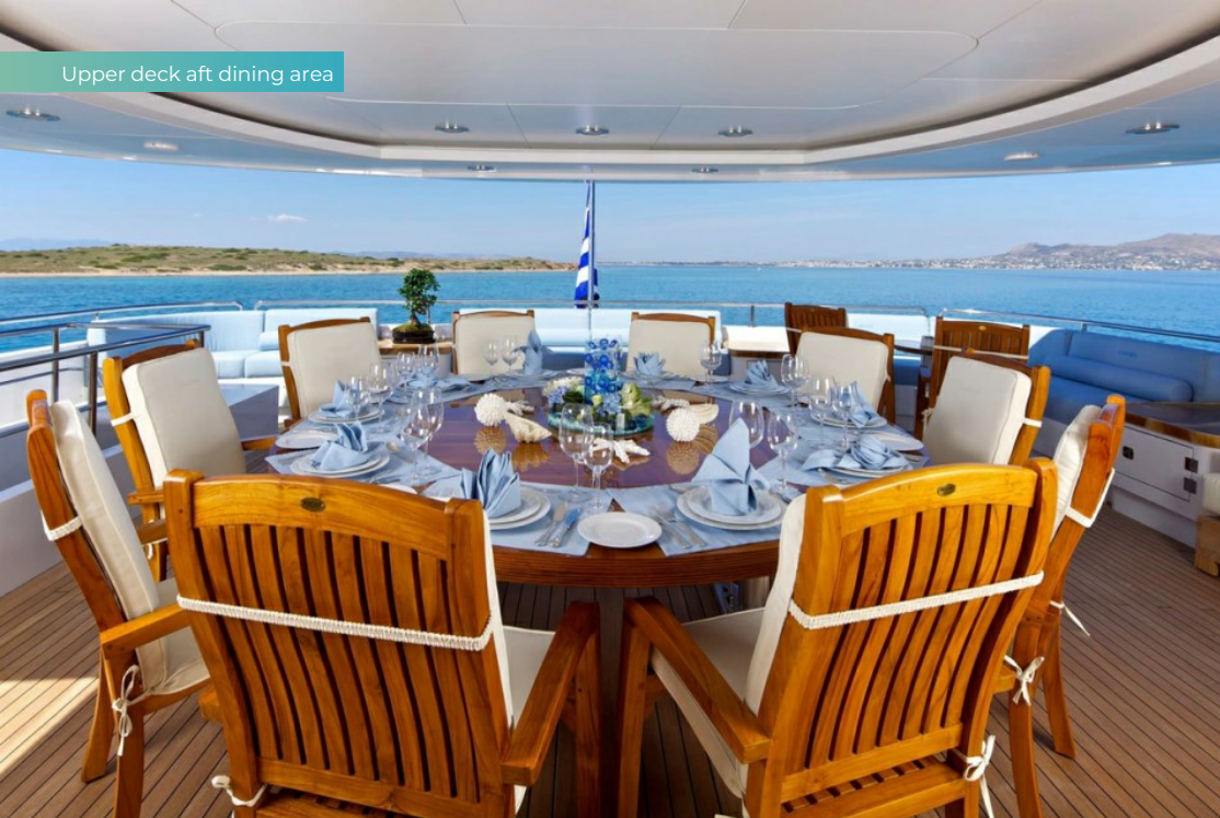
Upper deck aft dining area