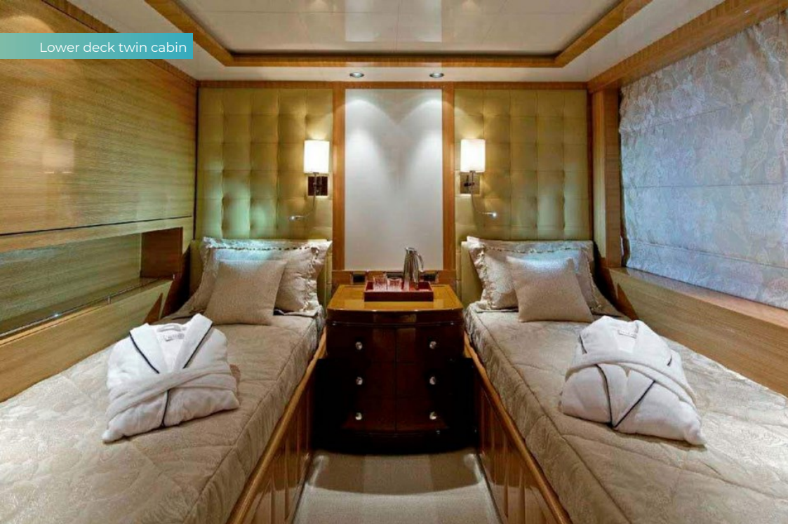
Lower deck twin cabin