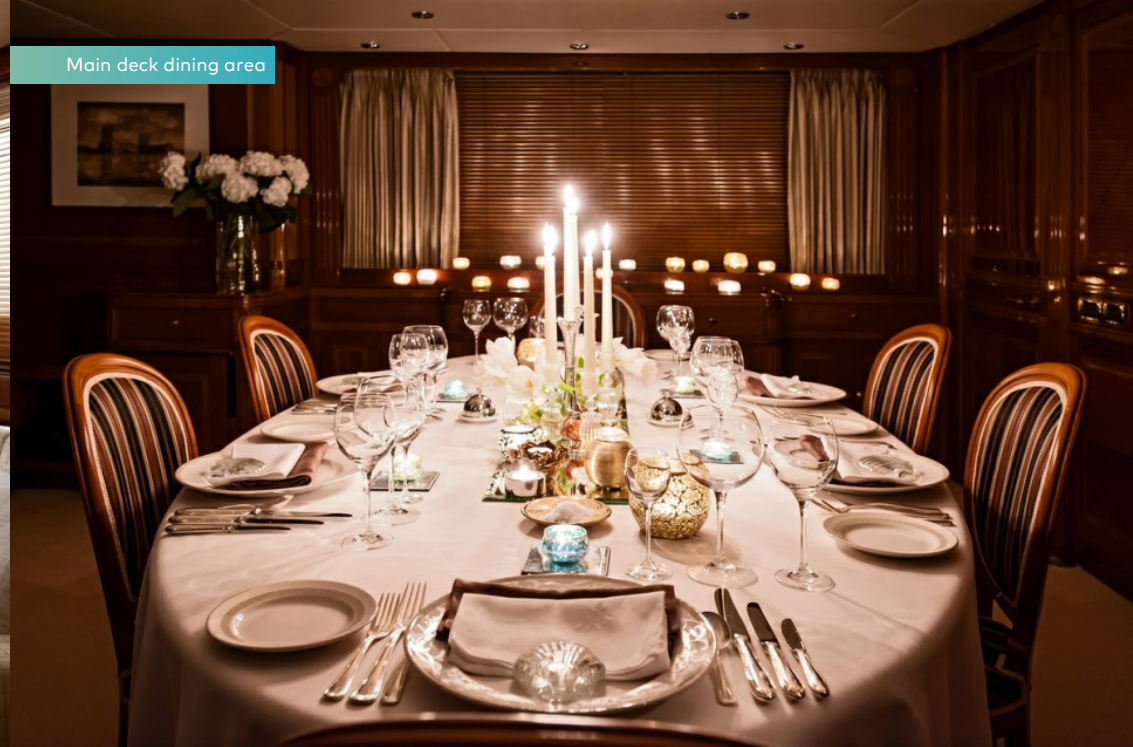
Main deck aft dining area