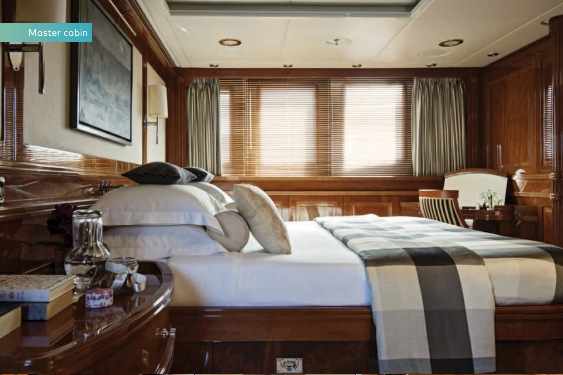
Master cabin study