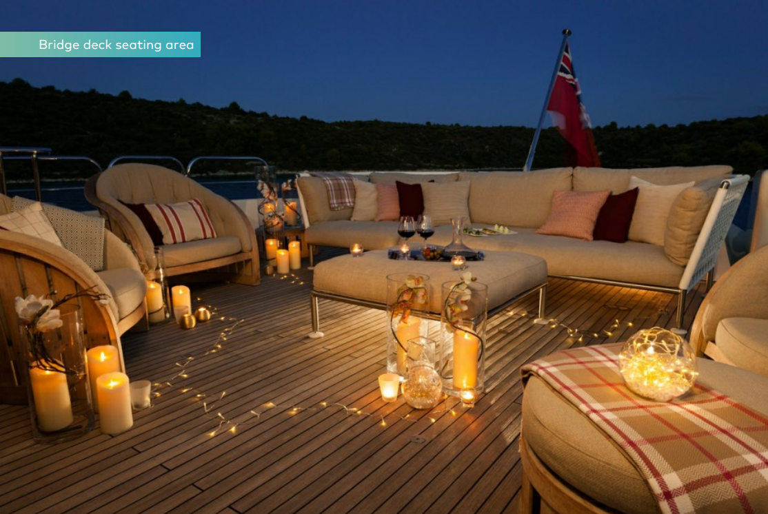
Bridge deck seating area