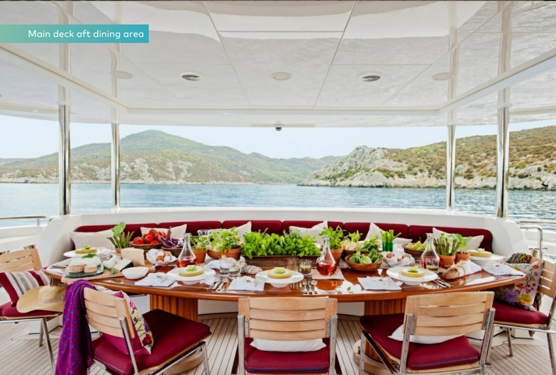
Main deck aft dining area