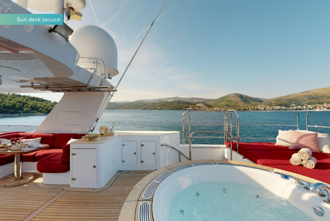
Sun deck jacuzzi