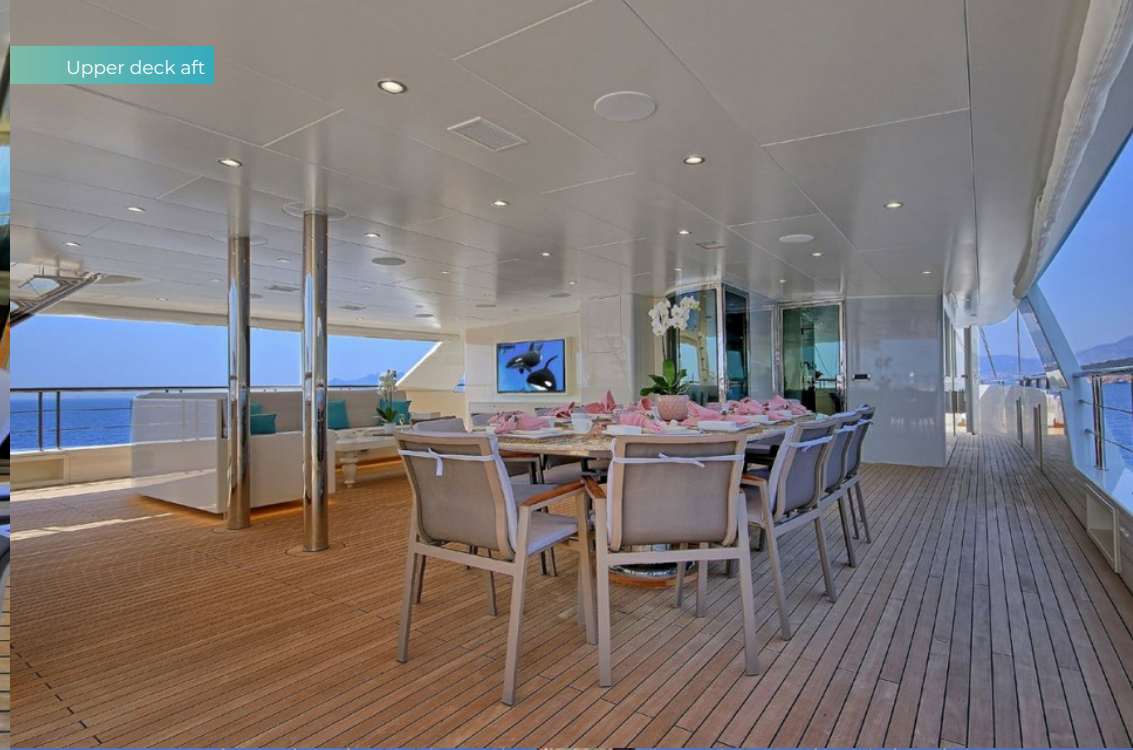
Upper deck aft