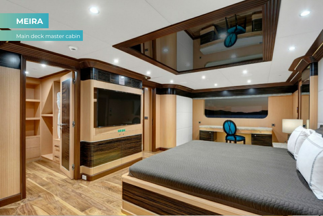
Main deck master cabin