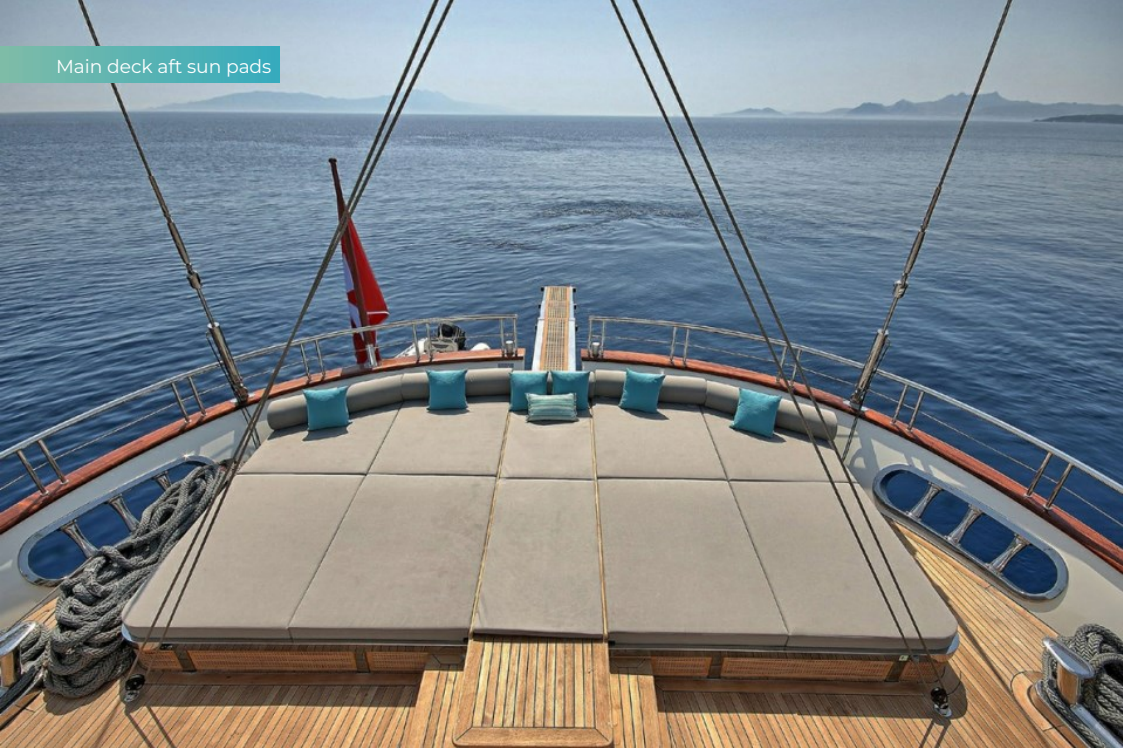
Main deck aft sun pads