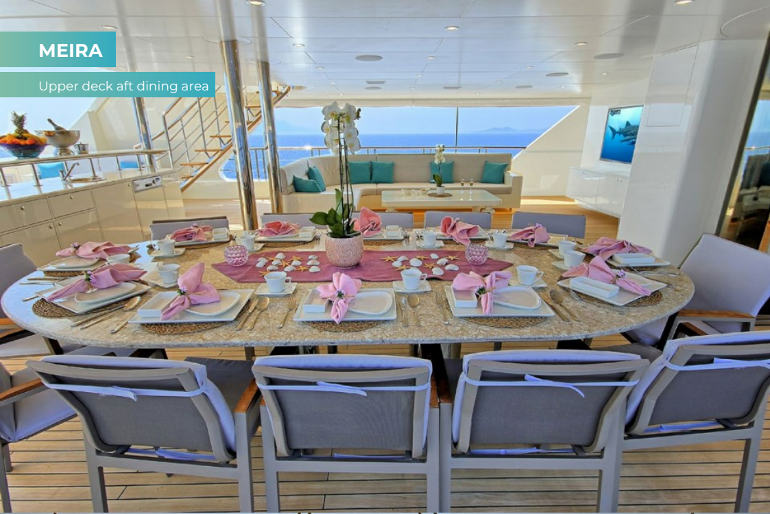
Upper deck aft dining area