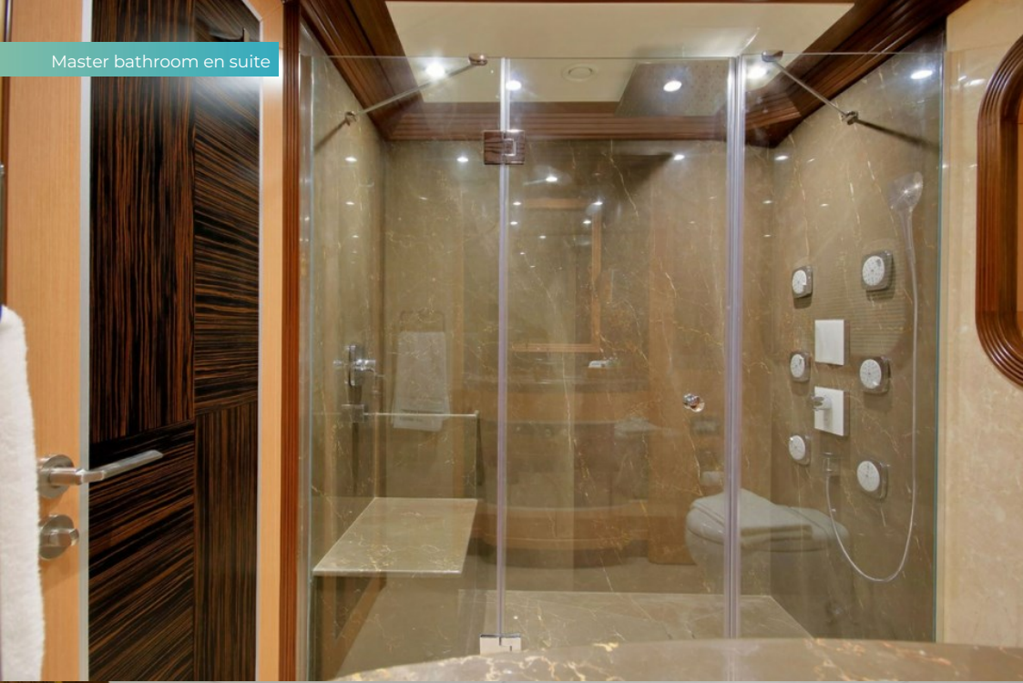
Master bathroom en suite