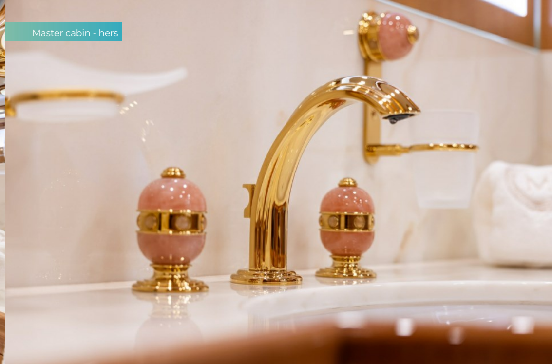
Master cabin - hers