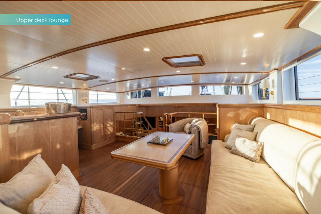
Upper deck lounge