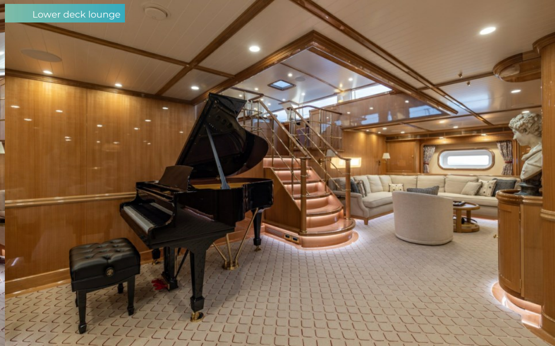
Lower deck lounge