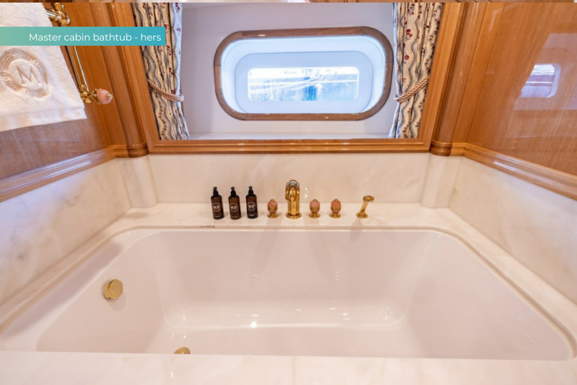
Master cabin bathtub - hers