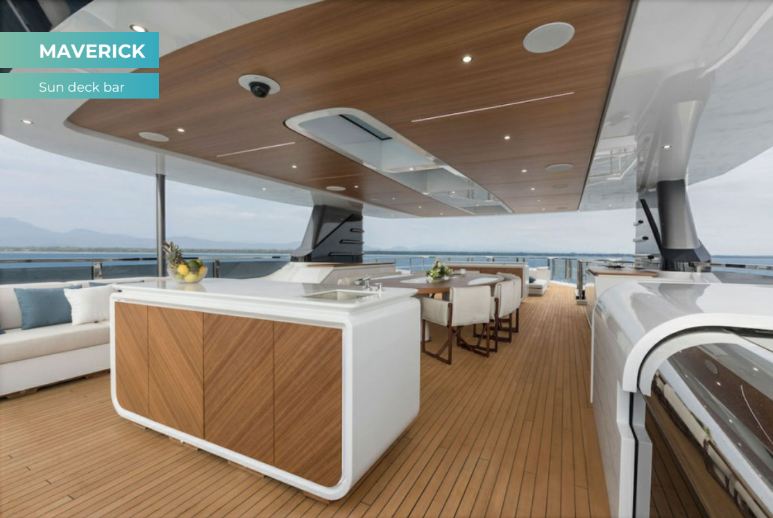
Sun deck bar