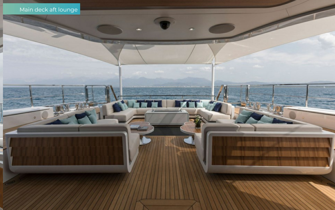
Main deck aft lounge