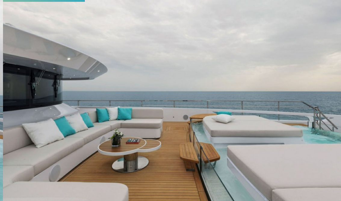
Foredeck seating area