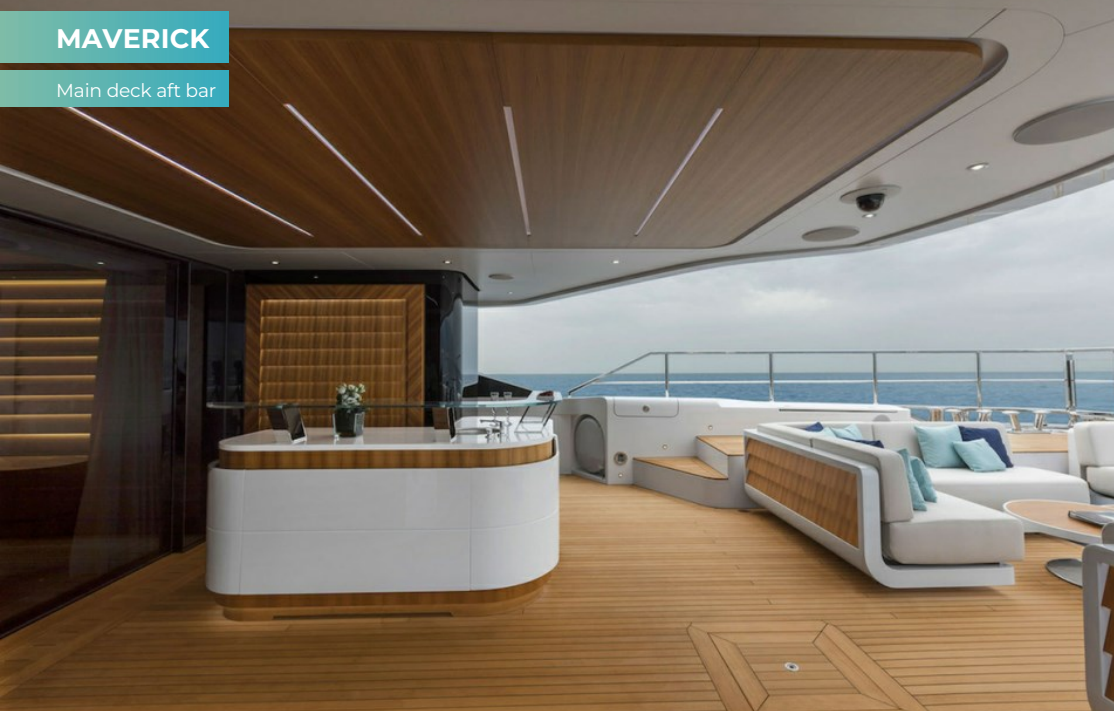
Main deck aft bar