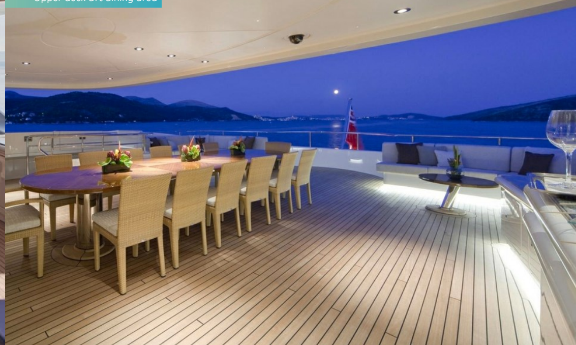
Upper deck aft dining area