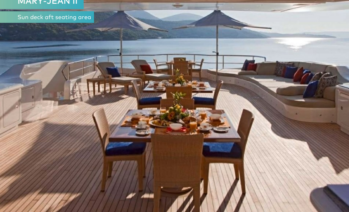
Sun deck aft seating area