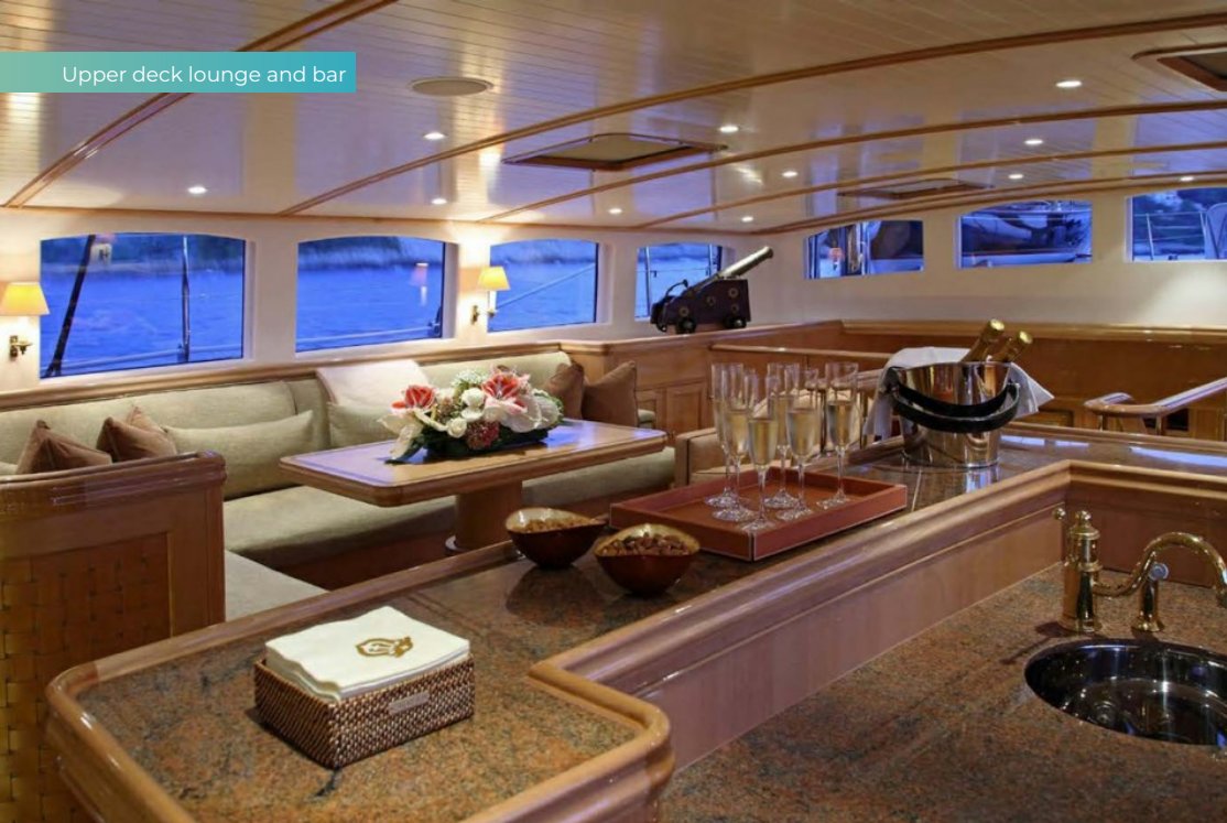
Upper deck lounge and bar