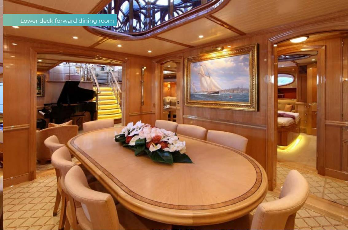
Lower deck forward dining room