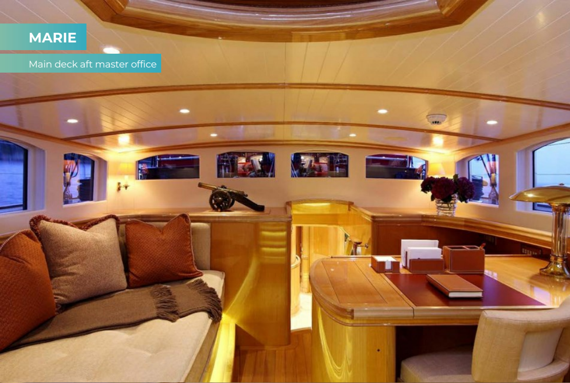
Main deck aft master office