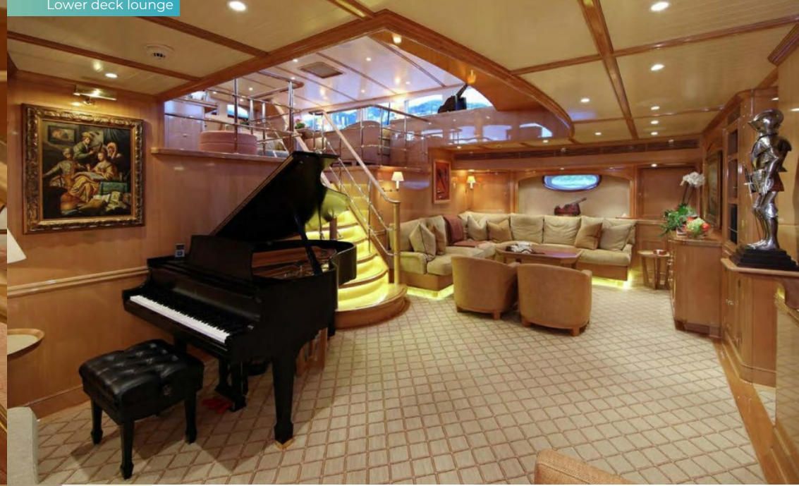
Lower deck lounge