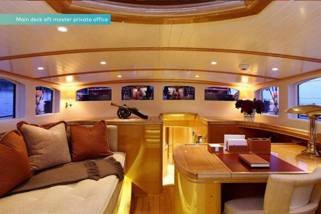
Main deck aft master private office