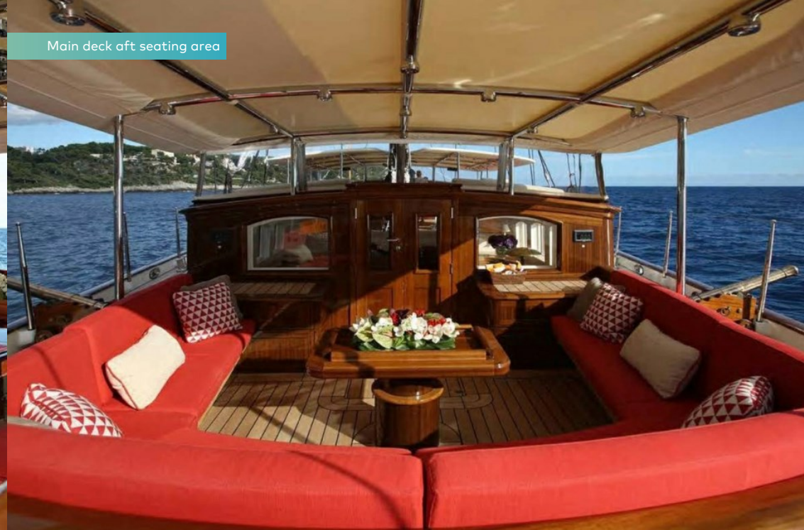
Main deck aft seating area