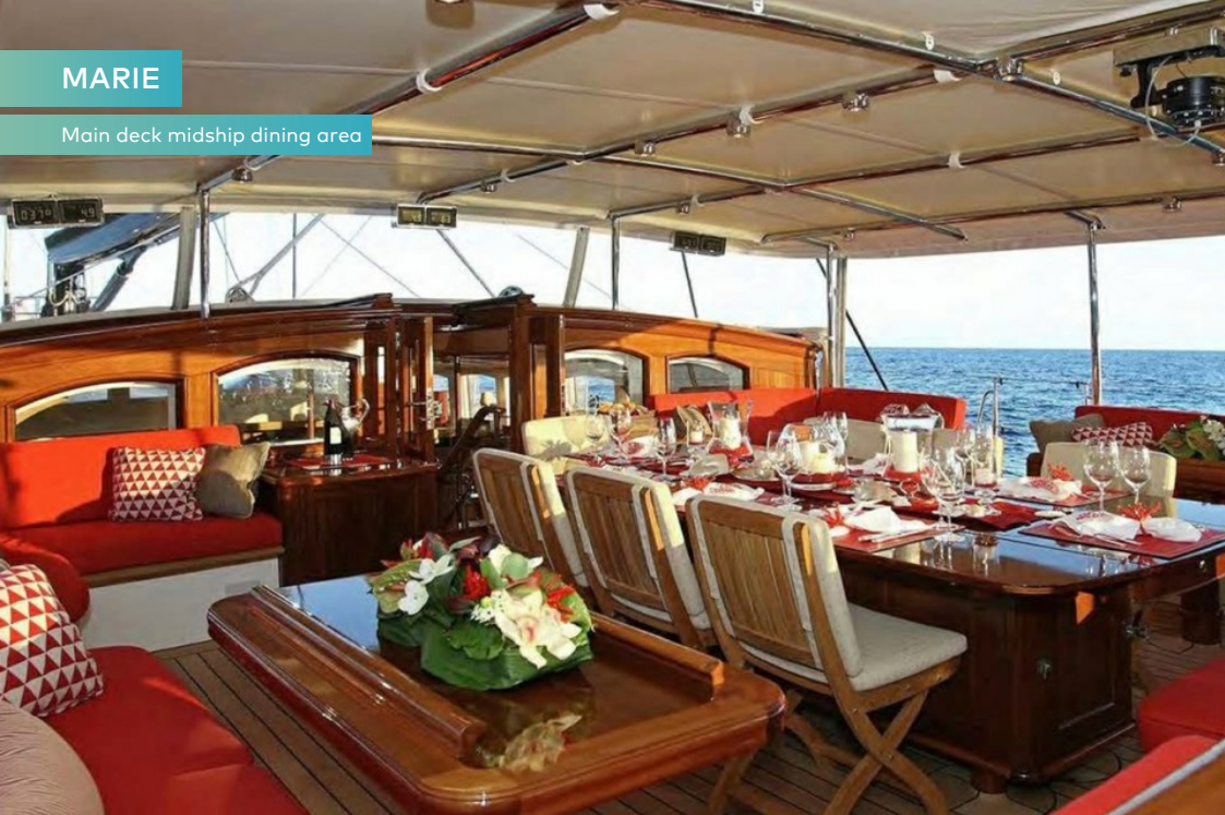
Main deck midship dining area