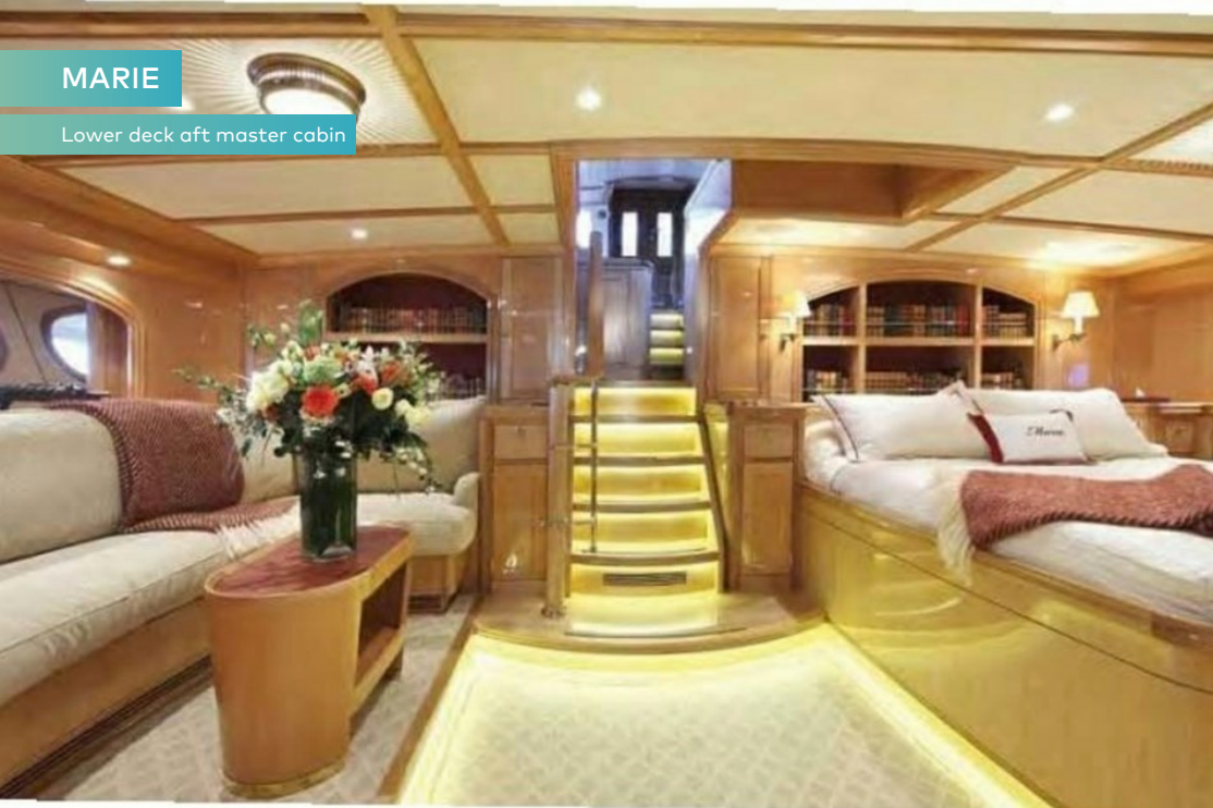
Lower deck aft master cabin