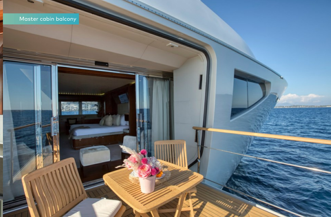
Master cabin balcony