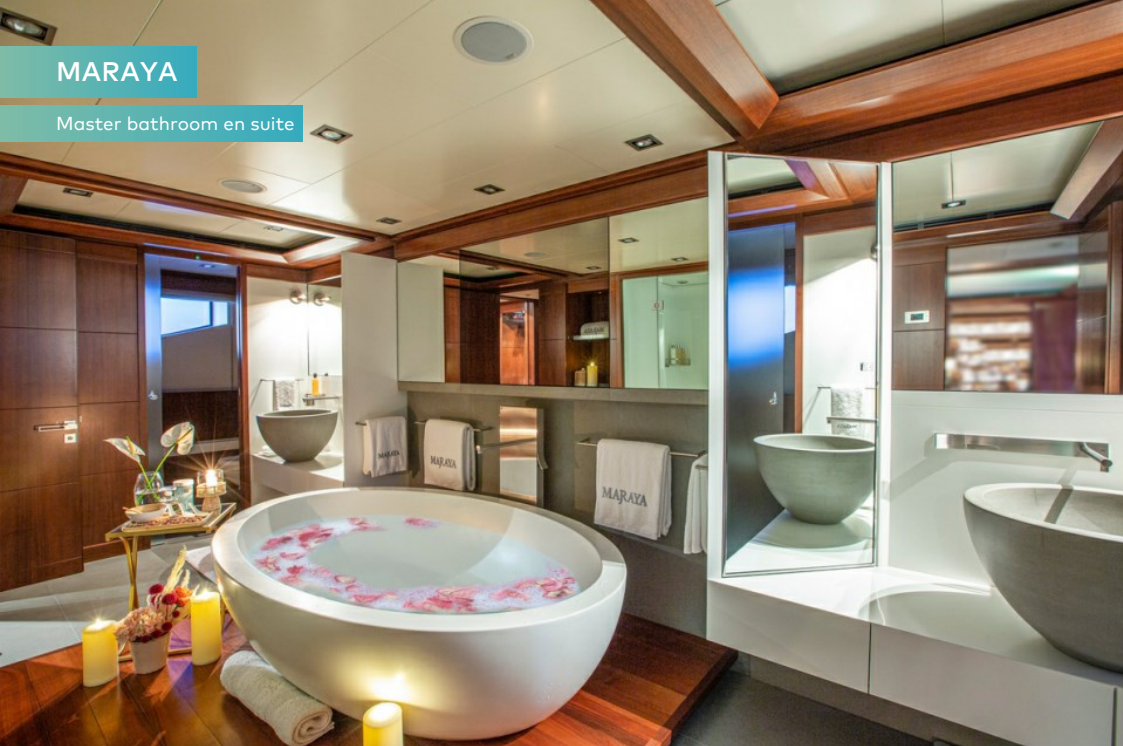
Master bathroom en suite