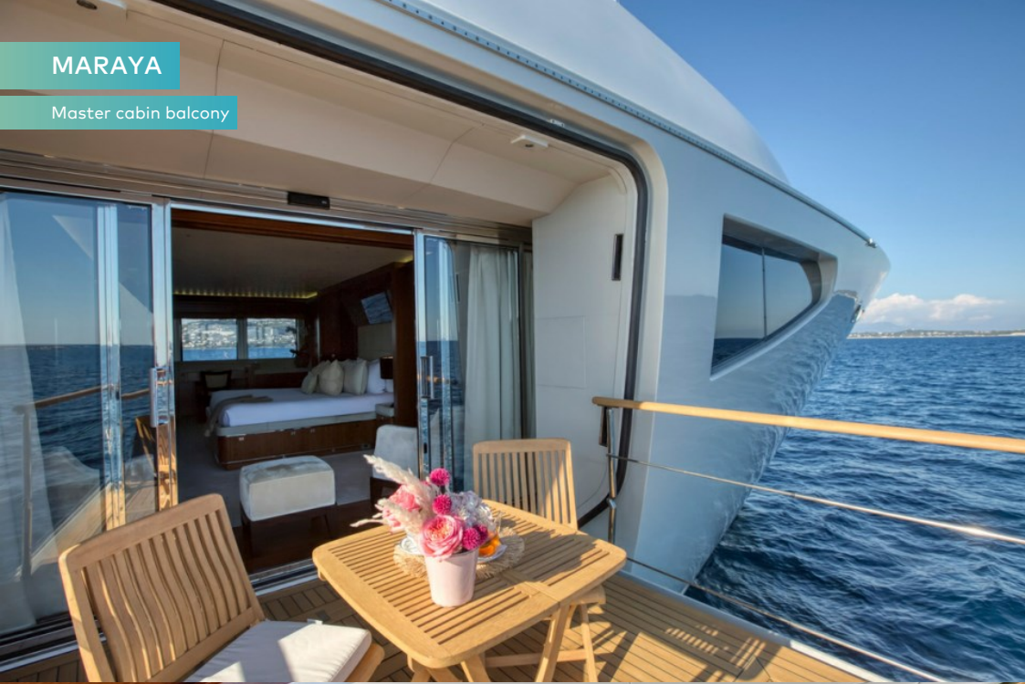
Master cabin balcony