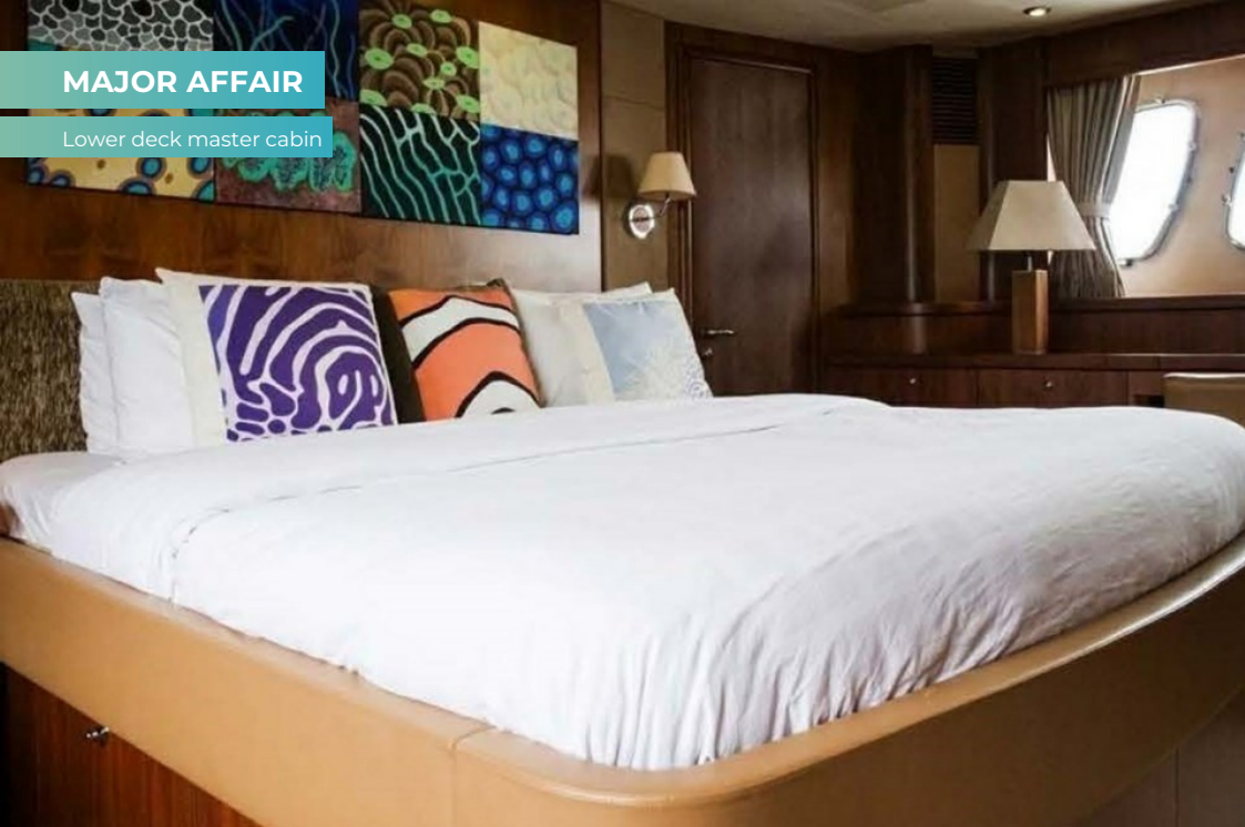
Lower deck master cabin