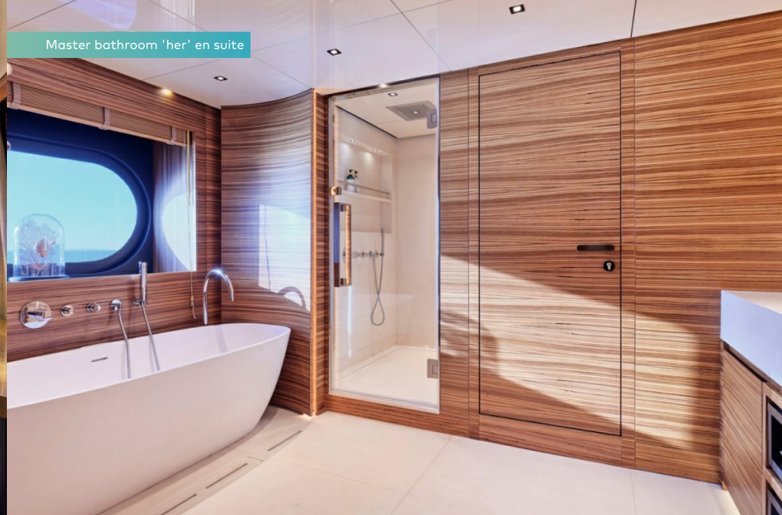
Master bathroom 'her' en suite