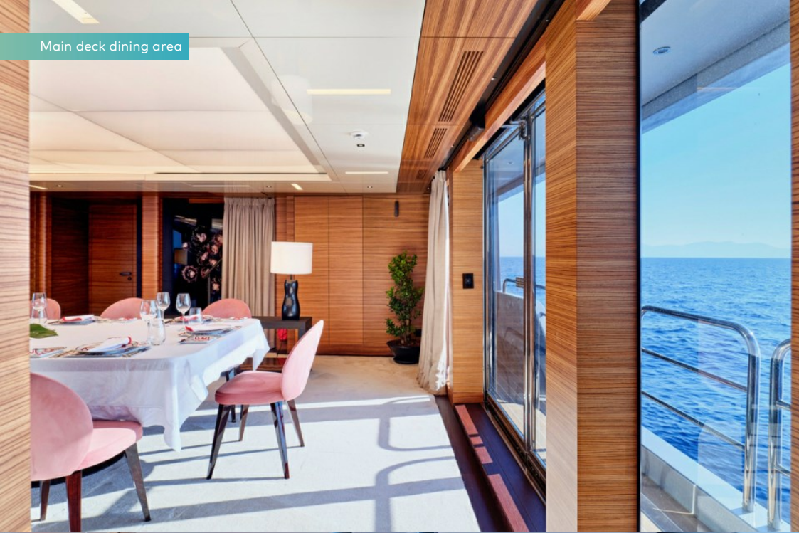
Main deck dining area