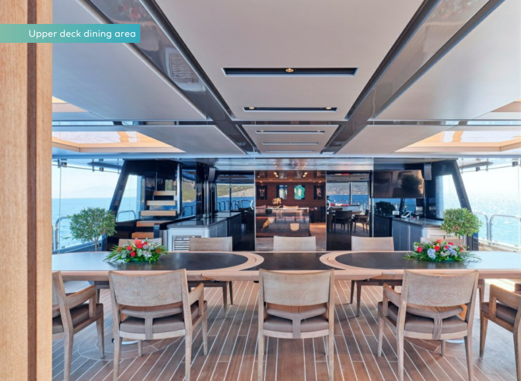
Upper deck dining area