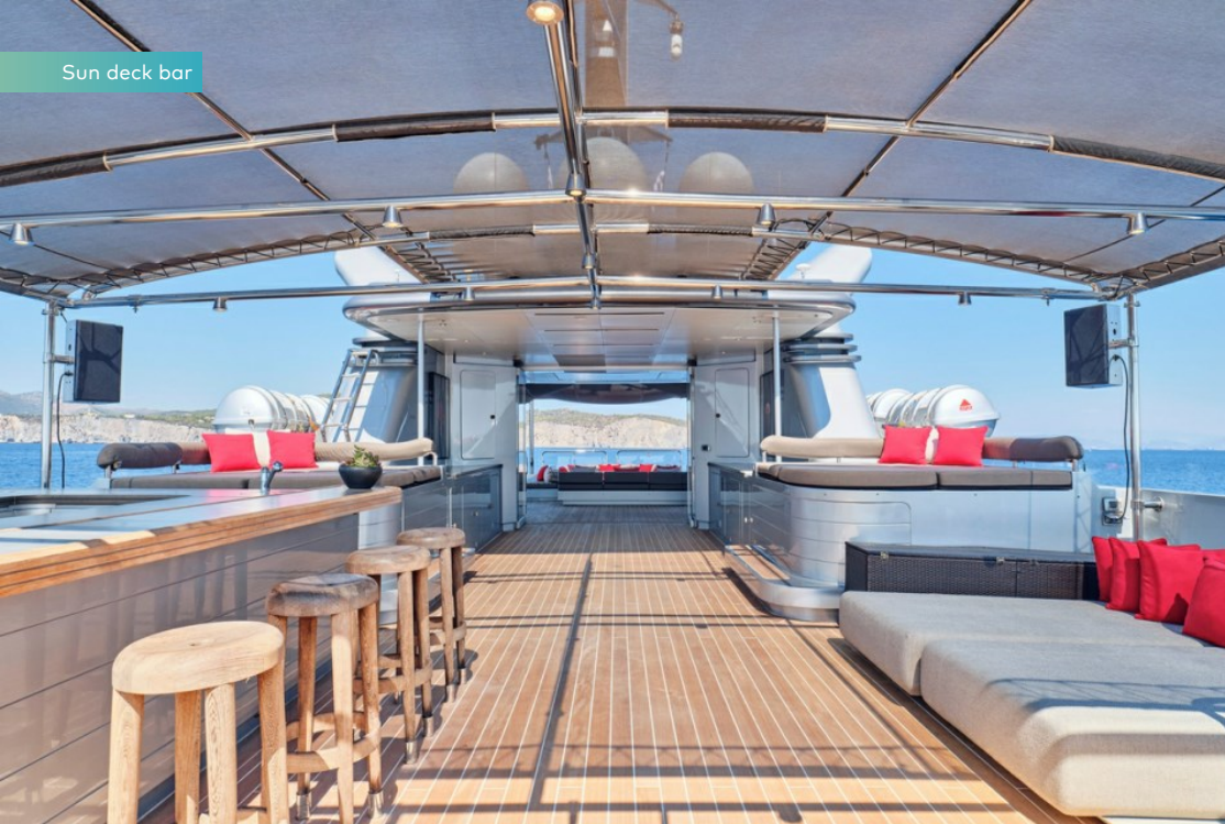
Sun deck bar