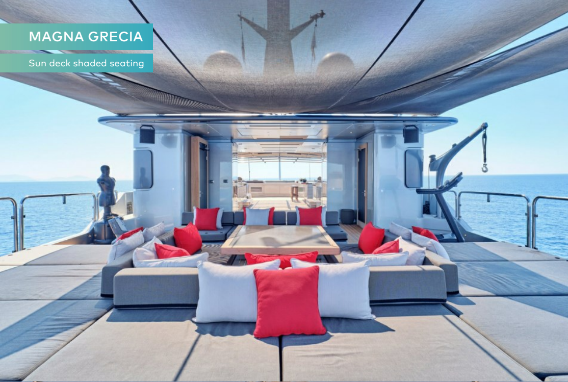
Sun deck shaded seating