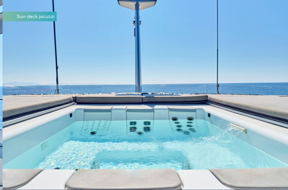
Sun deck jacuzzi