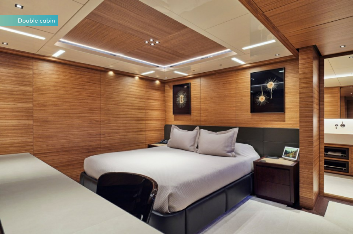
Double cabin bathroom