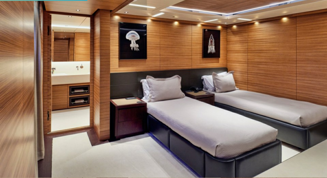
Twin cabin bathroom