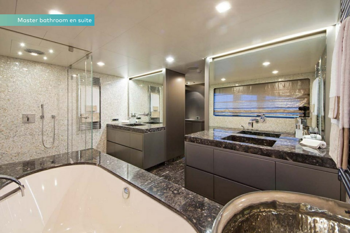
Master bathroom en suite