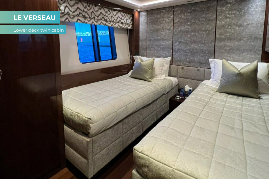
Lower deck twin cabin