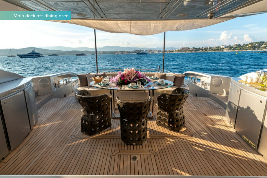
Main deck aft dining area