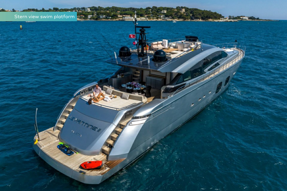
Stern view swim platform