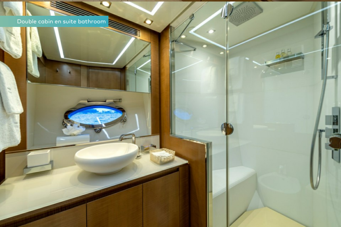
Double cabin en suite bathroom