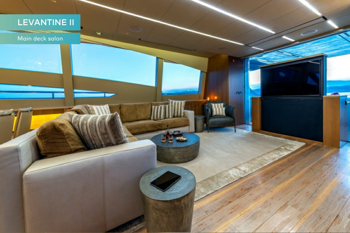
Main deck salon