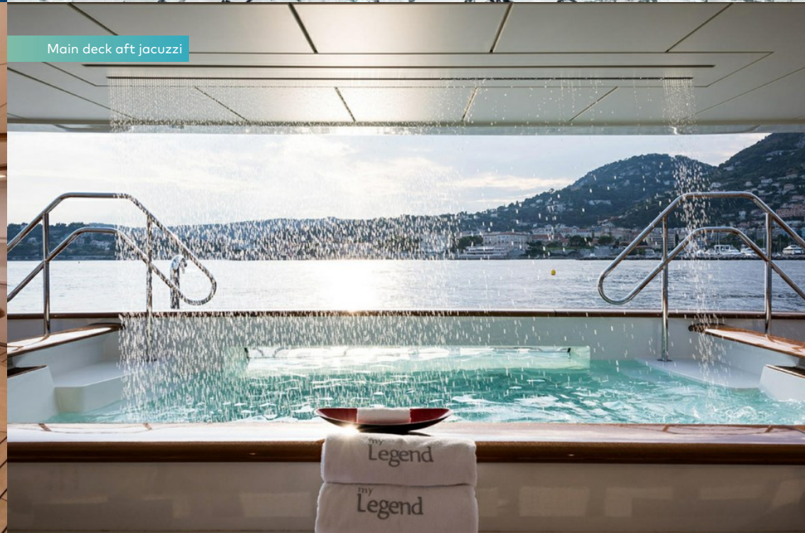
Main deck aft jacuzzi