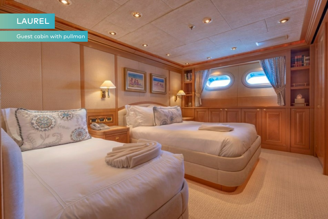
Guest cabin with pullman