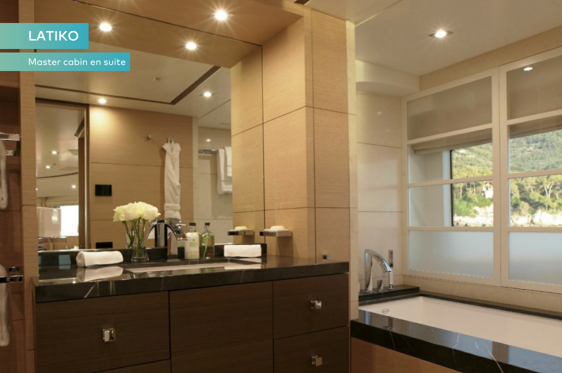
Master cabin en suite