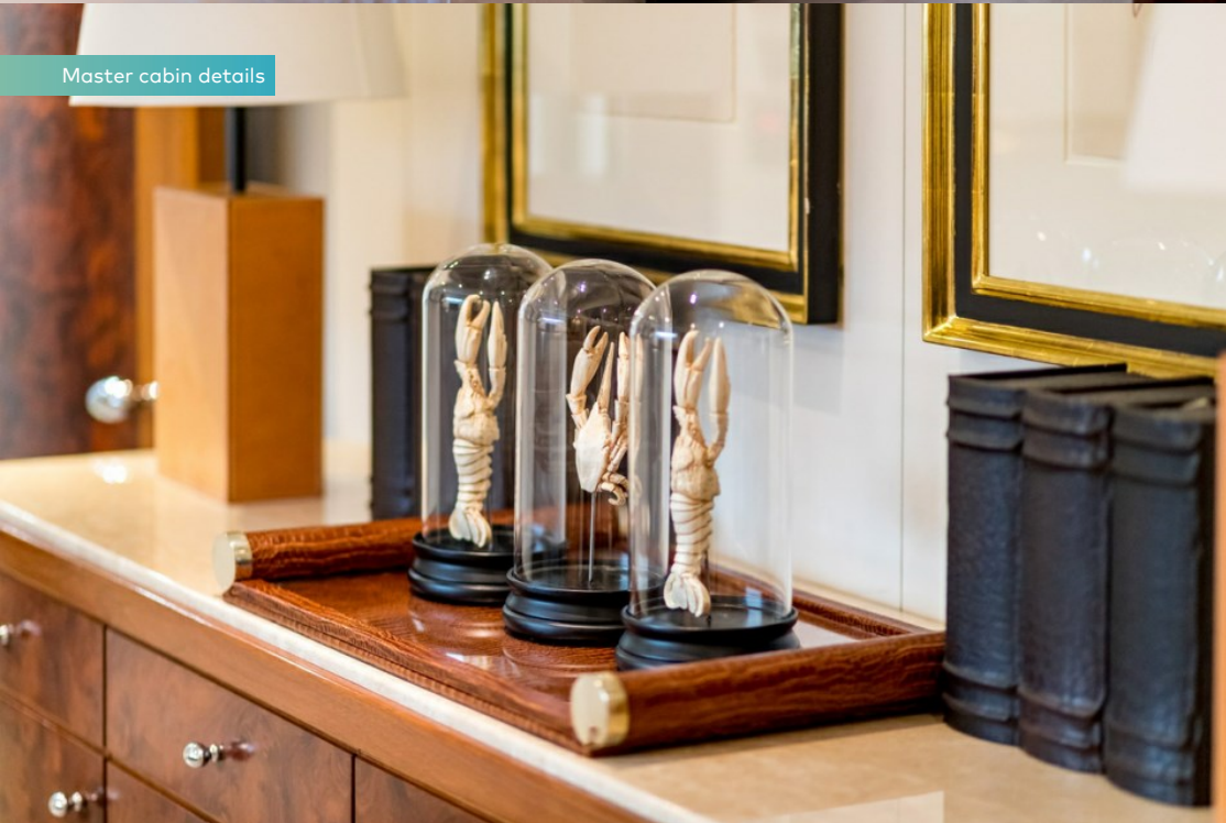
Master cabin details