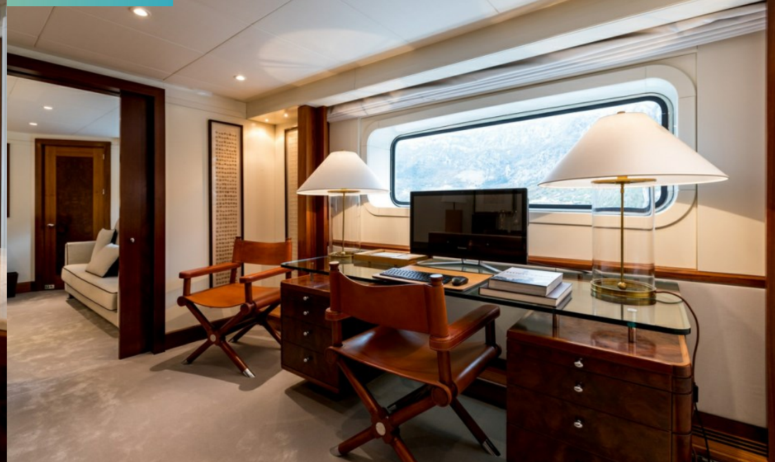
Master cabin office