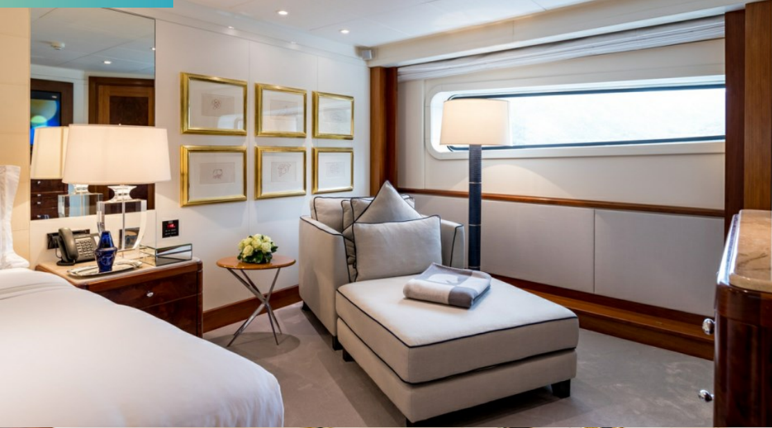
Master cabin details