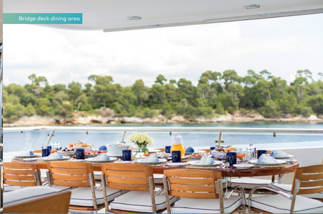
Bridge deck dining area