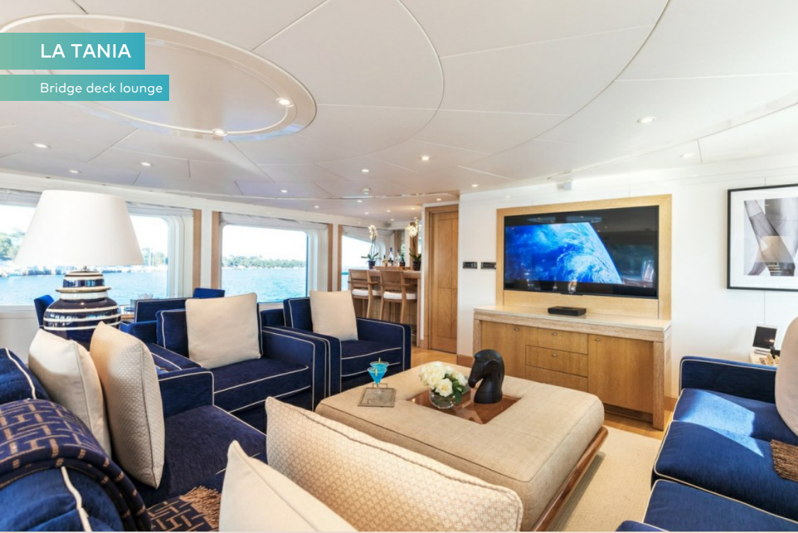
Bridge deck lounge