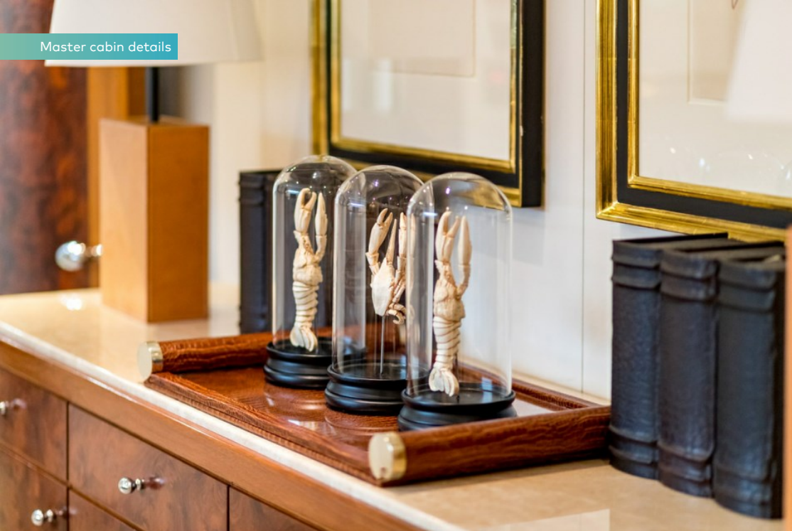
Master cabin details