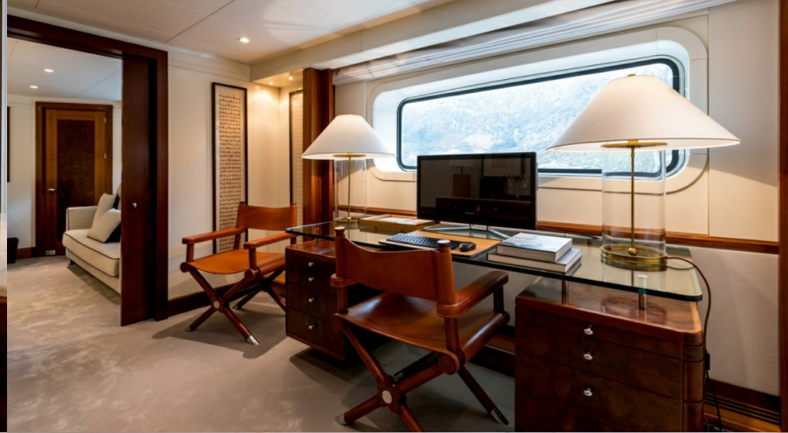
Master cabin office