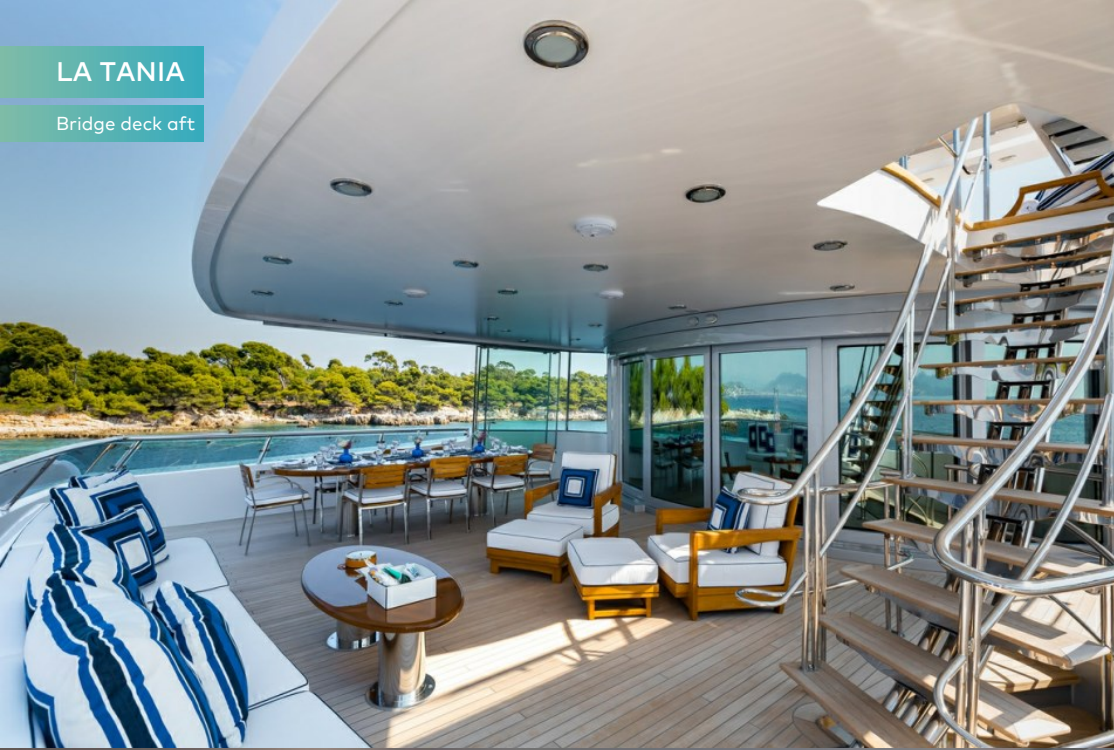
Bridge deck aft