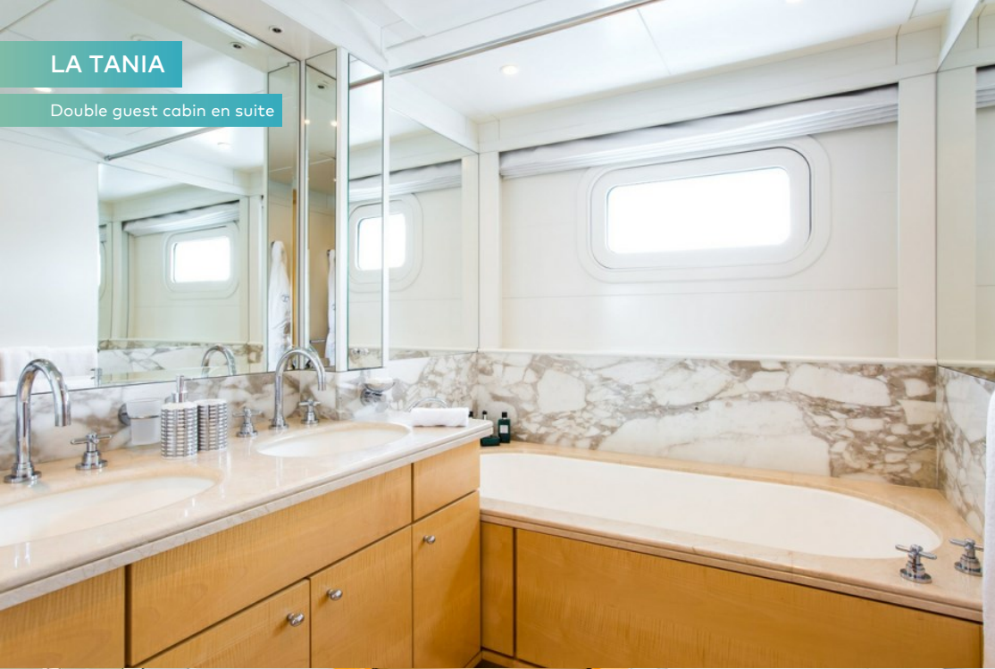
Double guest cabin en suite