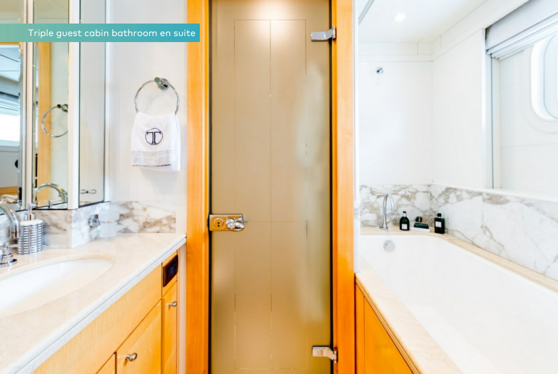
Triple guest cabin bathroom en suite