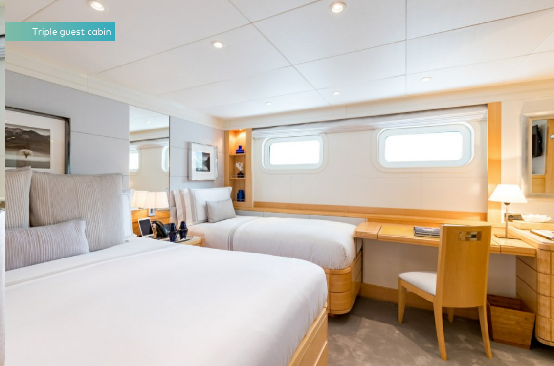
Triple guest cabin