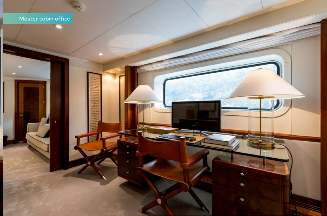
Master cabin office