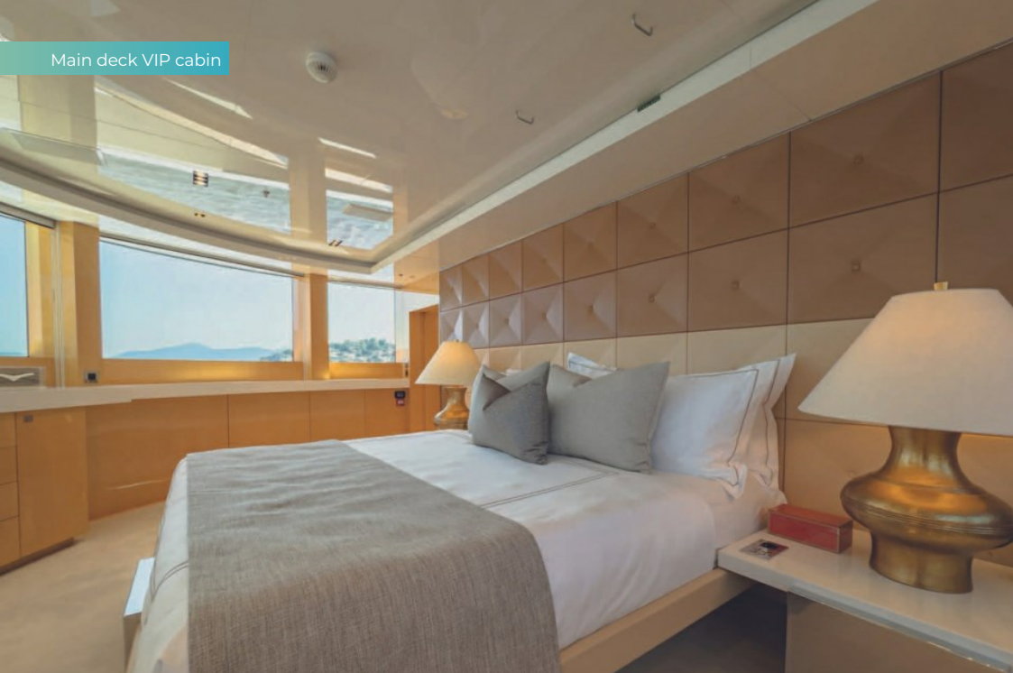
Main deck VIP cabin