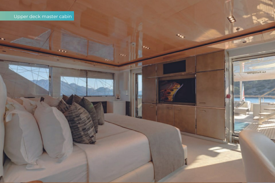
Upper deck master cabin