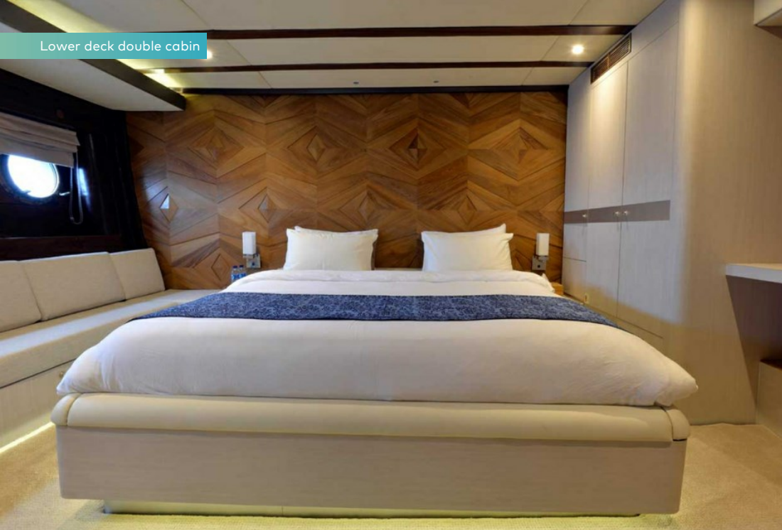
Lower deck double cabin