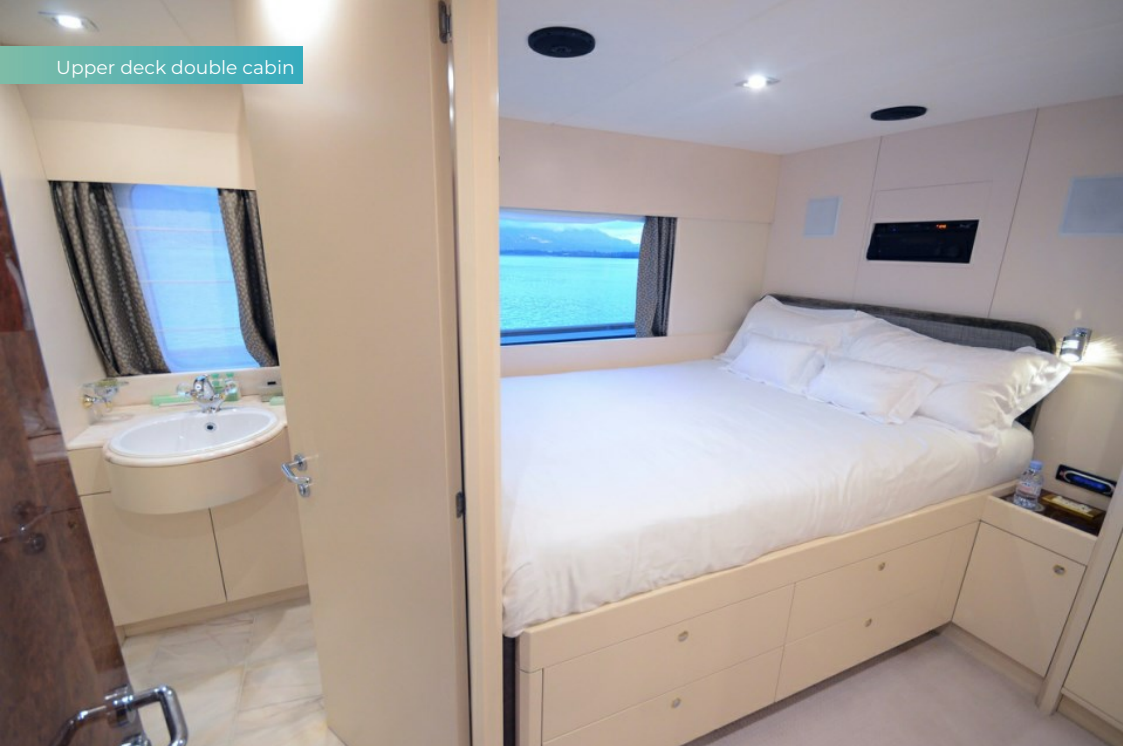
Upper deck double cabin