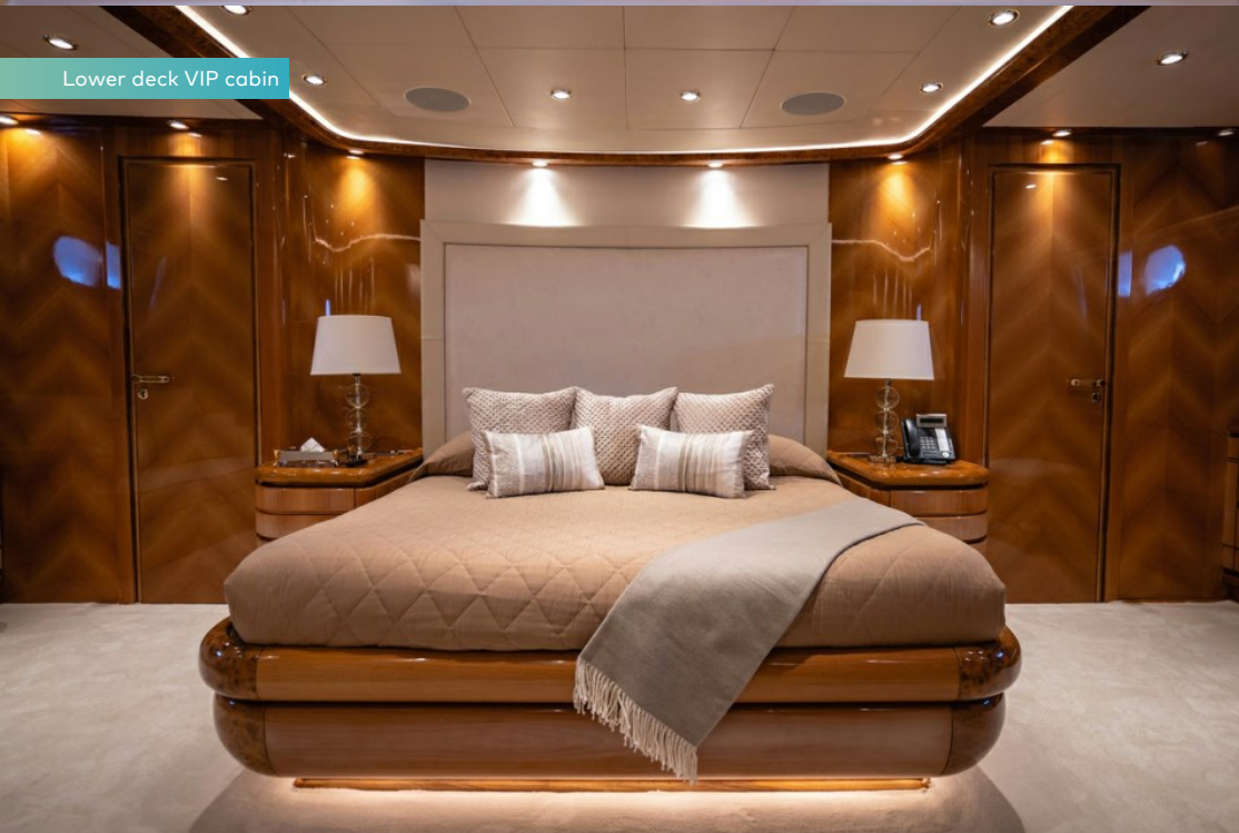
Lower deck VIP cabin