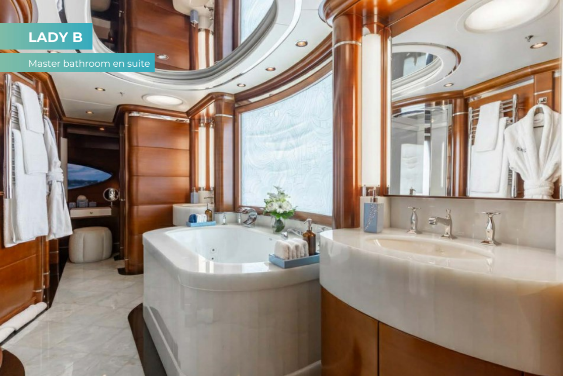
Master bathroom en suite