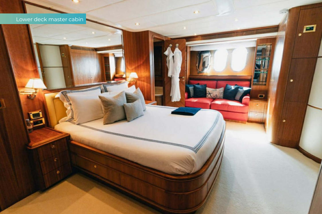
Lower deck master cabin