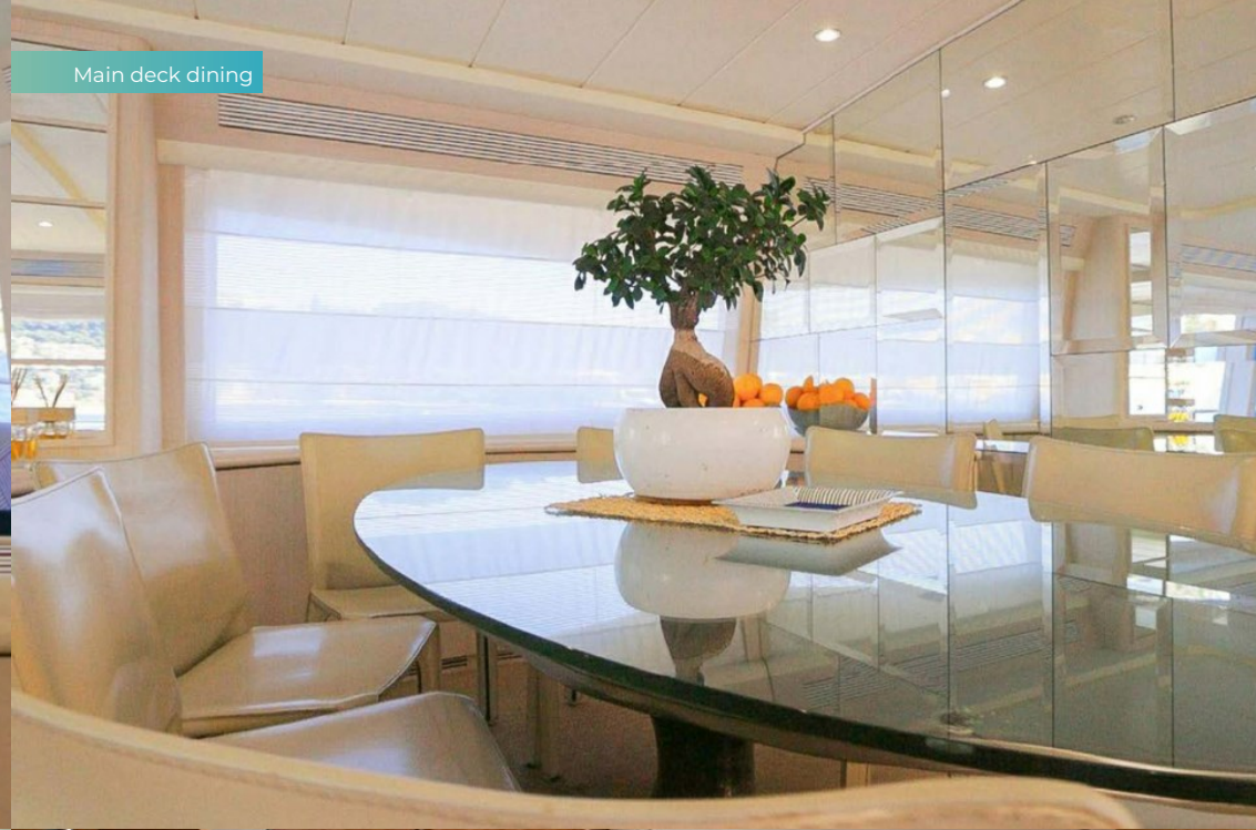
Main deck dining