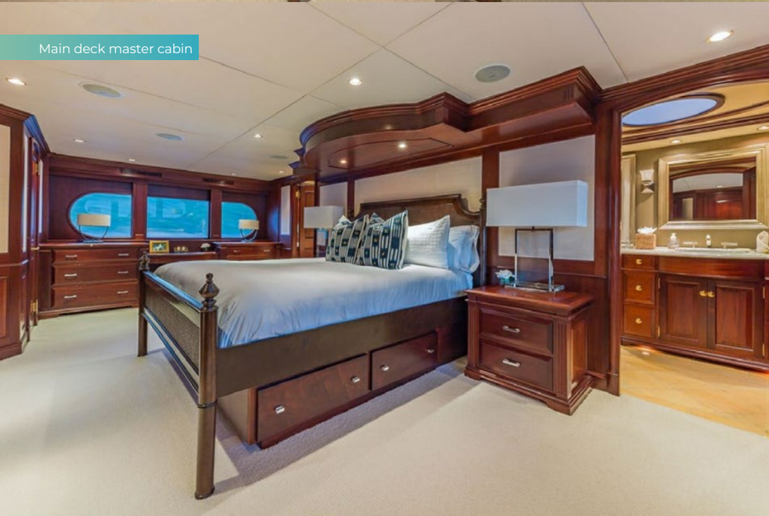
Main deck master cabin