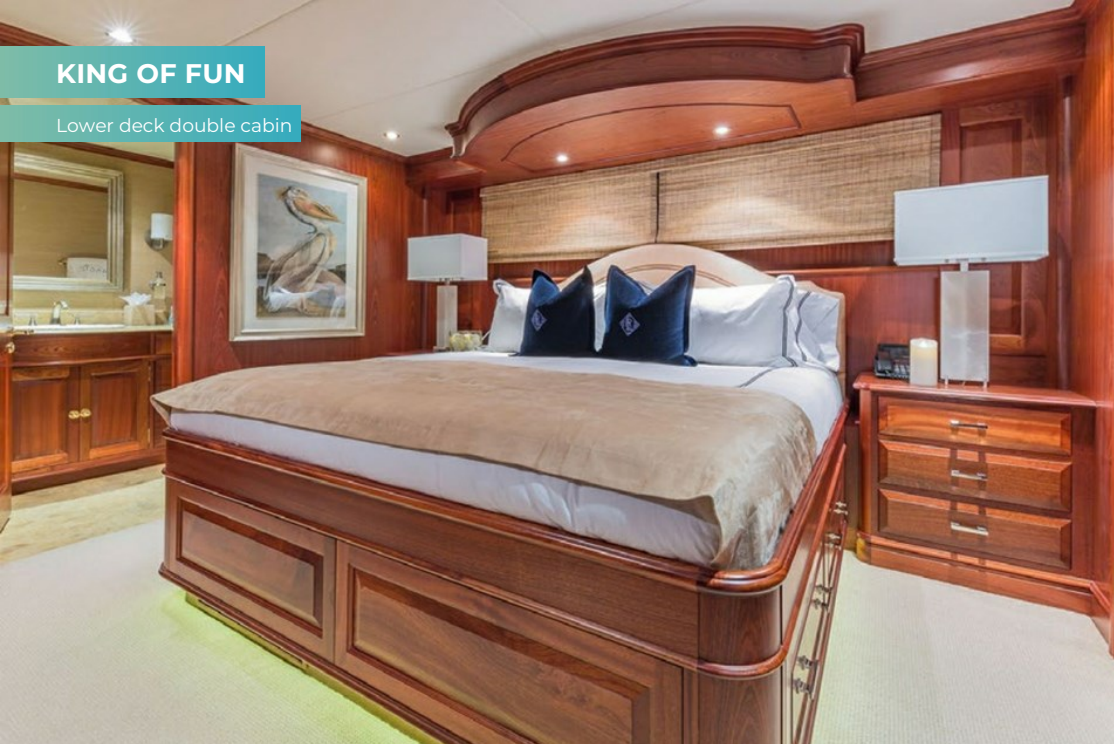
Lower deck double cabin