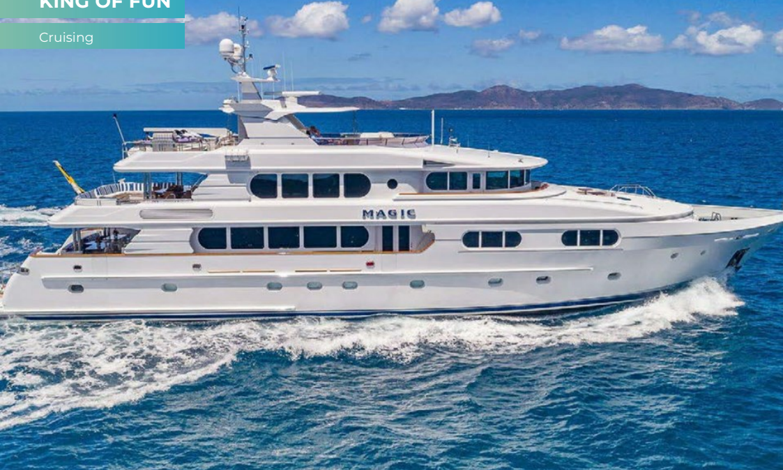
Sun deck jacuzzi