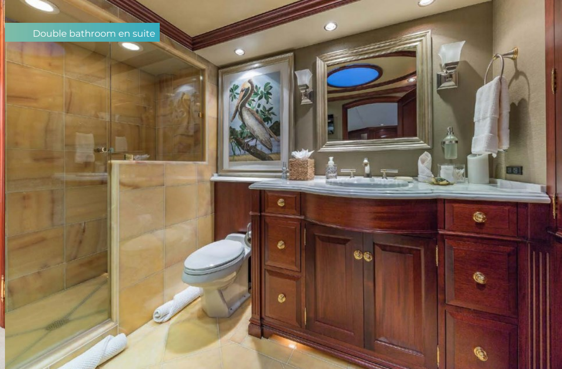
Double bathroom en suite