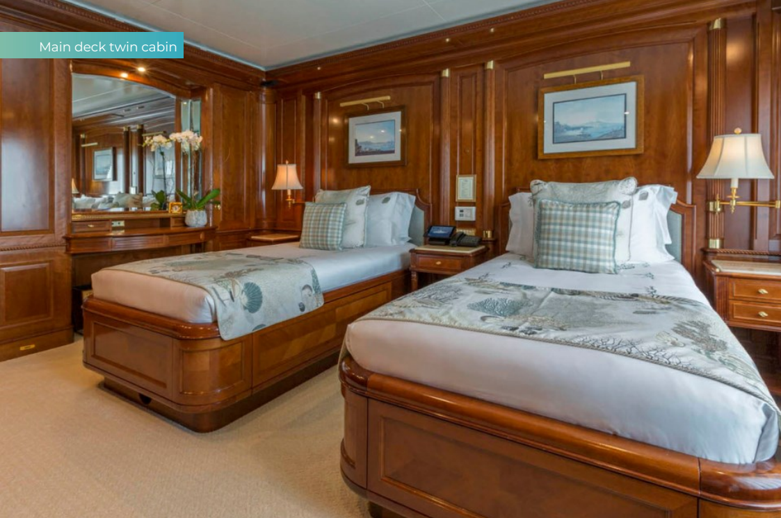
Main deck twin cabin