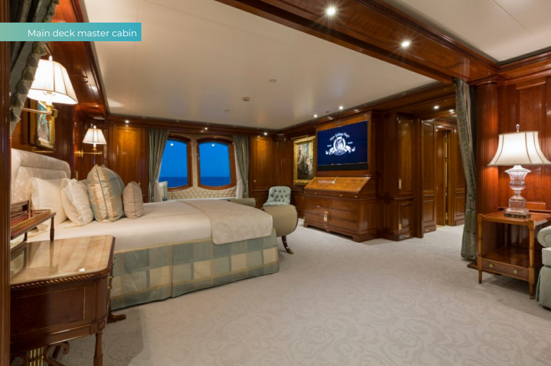
Main deck master cabin