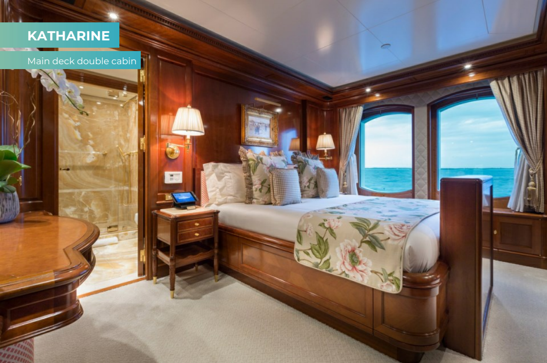
Main deck double cabin