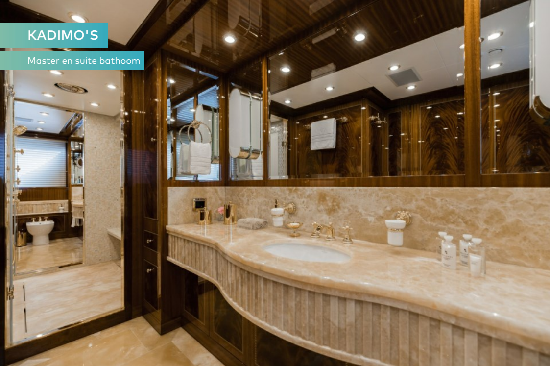
Master en suite bathroom