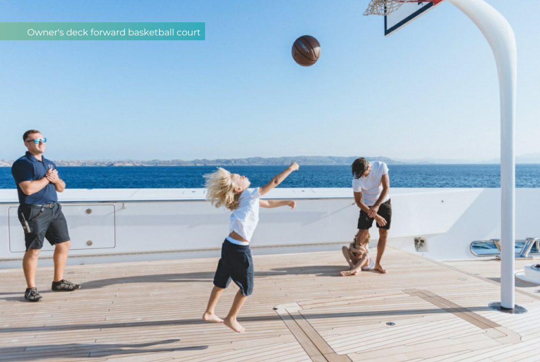
Owner's deck forward basketball court