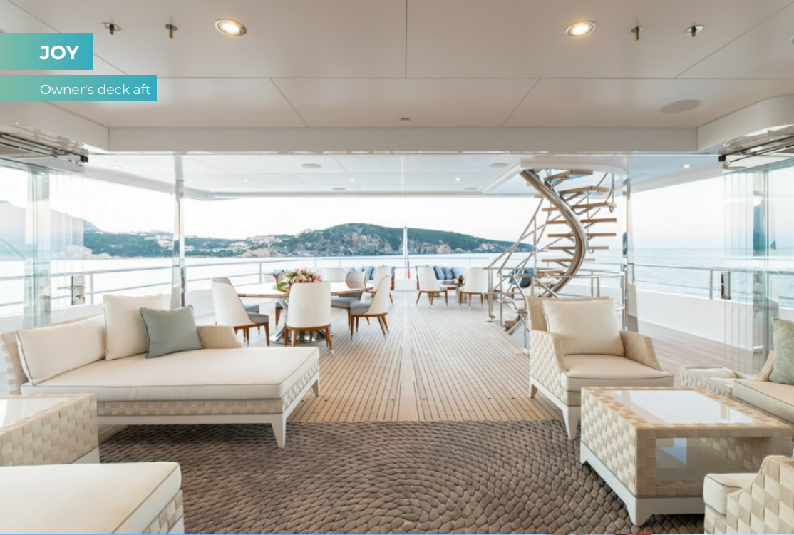
Owner's deck aft