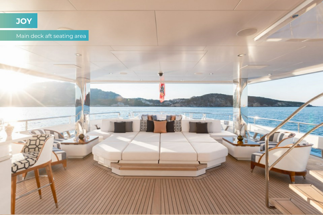
Main deck aft seating area