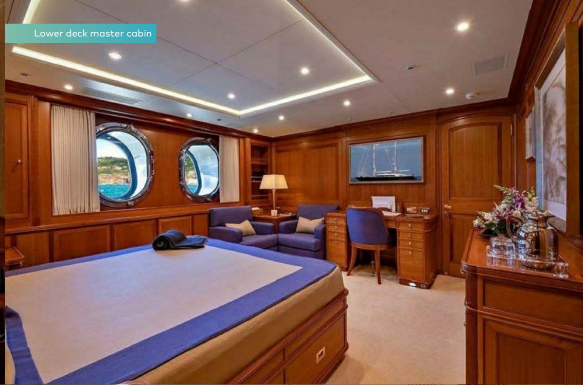
Lower deck master cabin