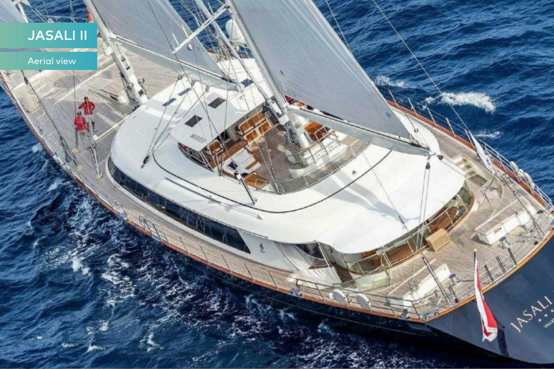
Main deck aft lounge