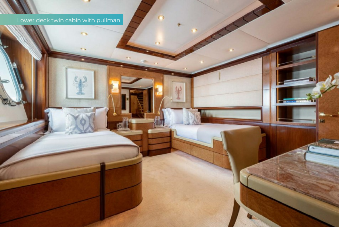
Lower deck twin cabin with pullman