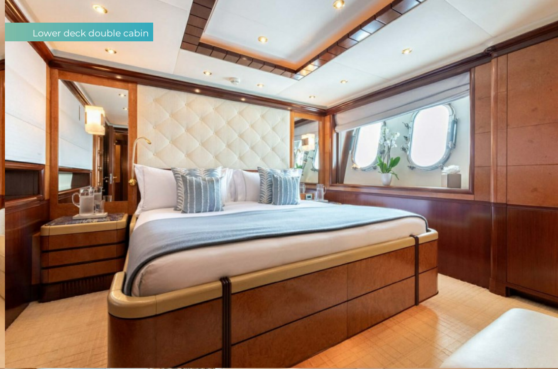
Lower deck double cabin