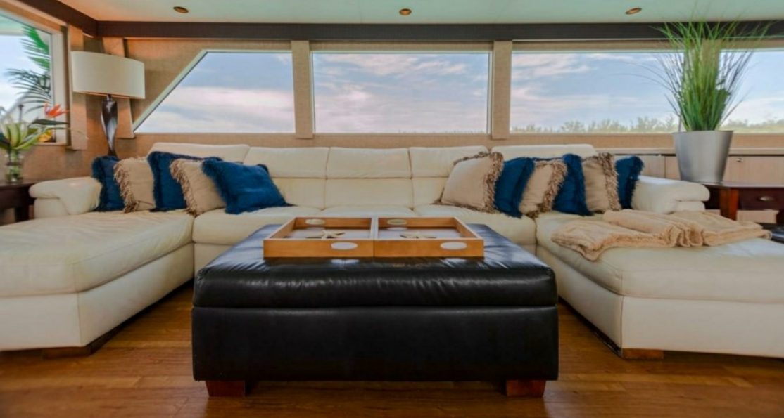
Main salon lounge