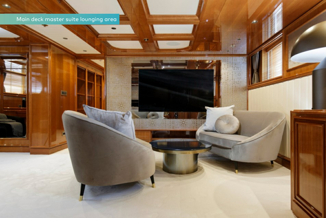
Main deck master suite lounging area