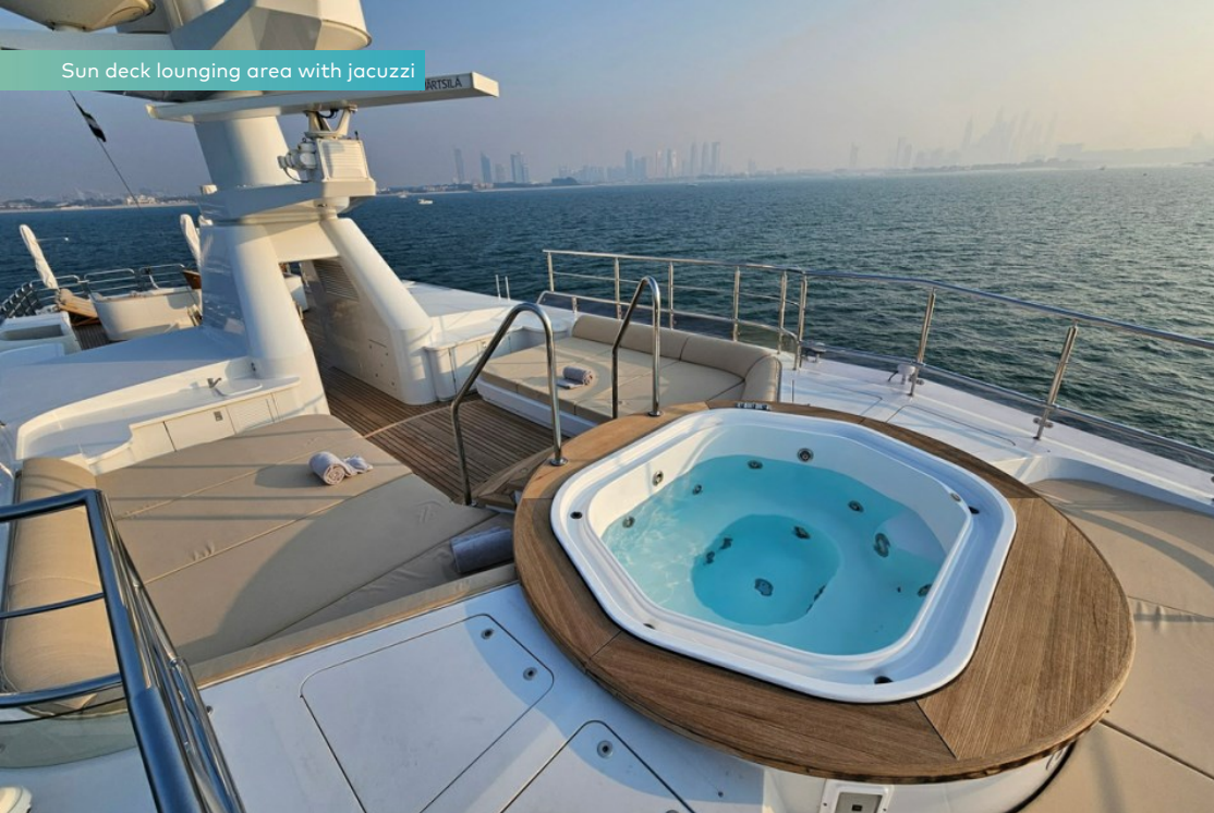
Sun deck lounging area with jacuzzi