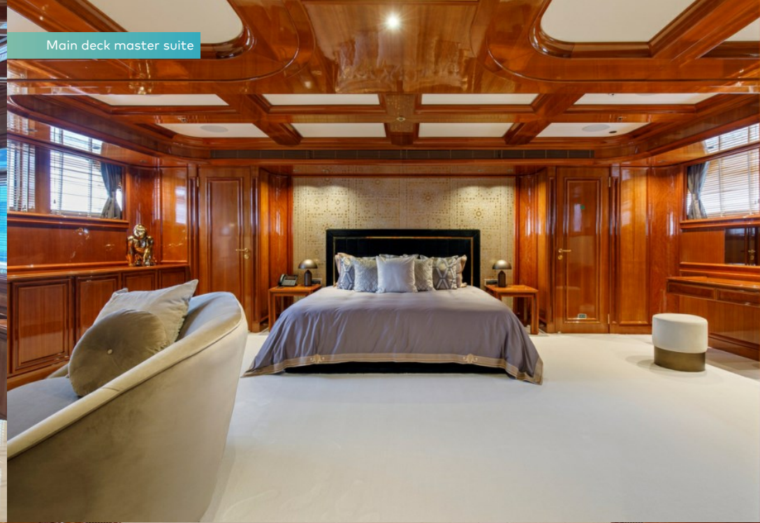
Main deck master suite