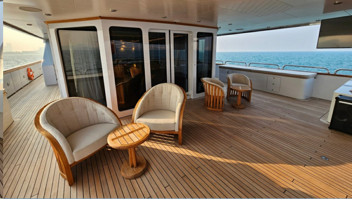
Bridge deck outdoor lounging area