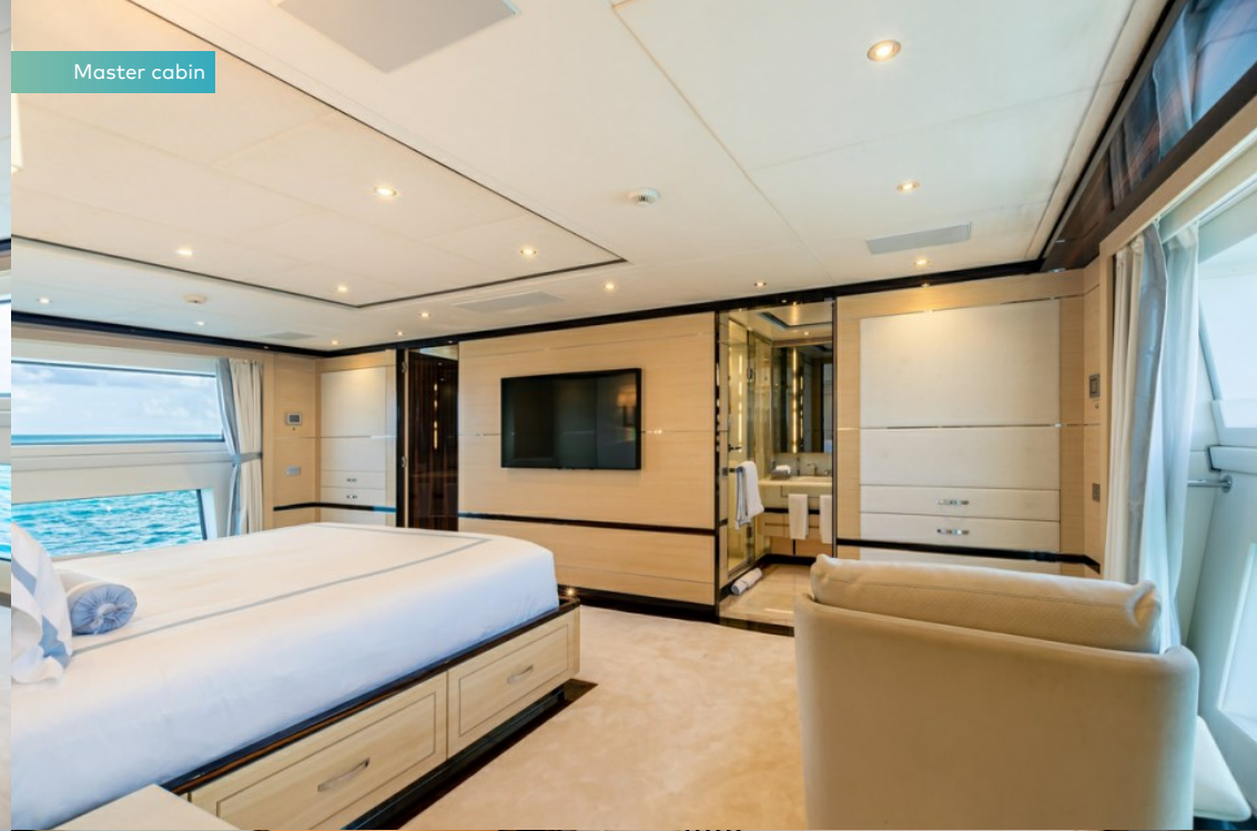
Master cabin fold-down sea terrace