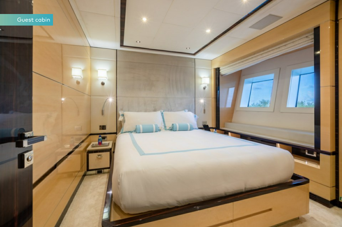
Guest cabin en suite