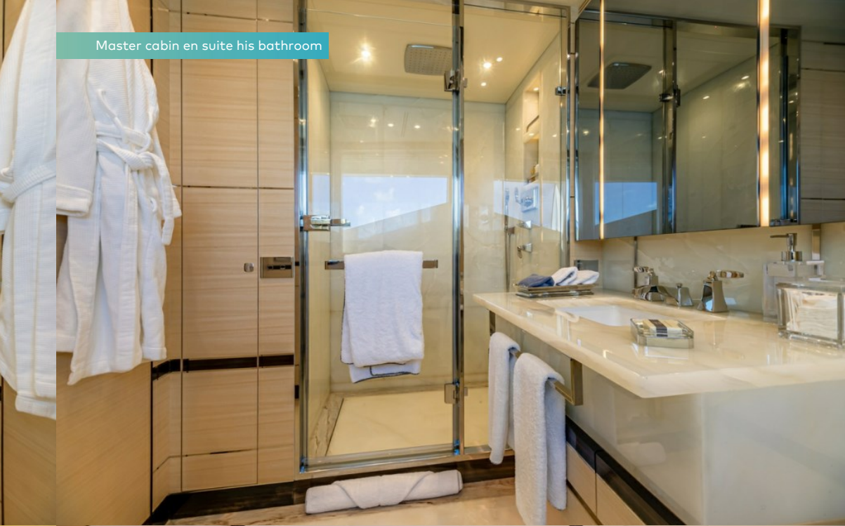
Master cabin en suite his bathroom