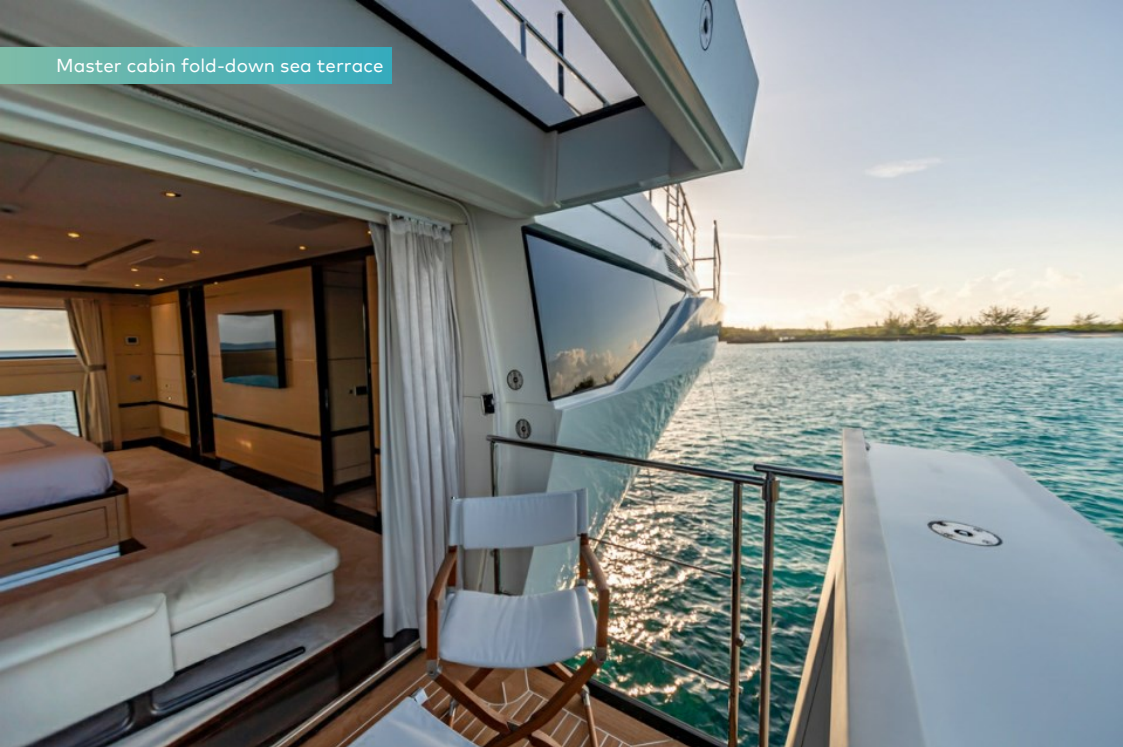
Master cabin fold-down sea terrace