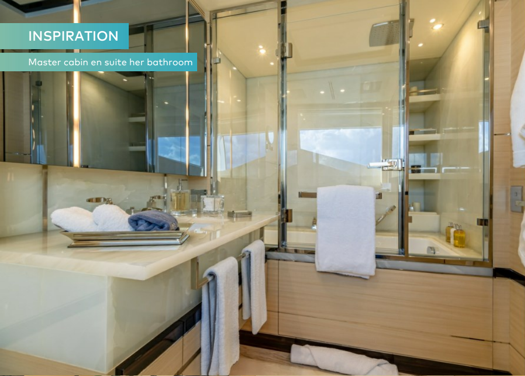
Master cabin en suite her bathroom